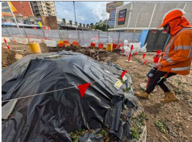
Figure 6 – Bankstown Station - Asbestos containing material stockpile, awaiting material classification report prior to offsite disposal to a licenced facility.