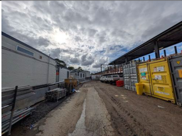
Figure 3 – Bankstown Station – Laydown area in use.