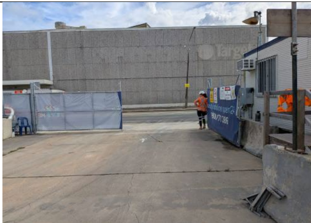
Figure 5 – Bankstown Station - Some dirt/mud tracking on hardstand area between site exit and laydown area. Street sweeper was in attendance at the time of inspection cleaning public road adjacent to the site.