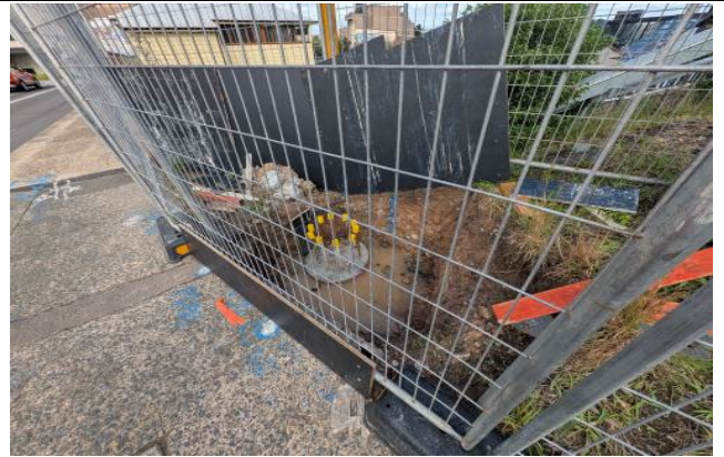
Figure 4 – Wardell Road – Piling completed, preparation works for girder delivery and installation in an upcoming possession.