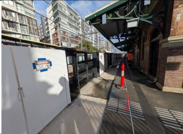
Figure 1 – Canterbury Station - Platform works, and station cleanup ongoing. Energisation complete in the preparation of testing and commissioning commencement.