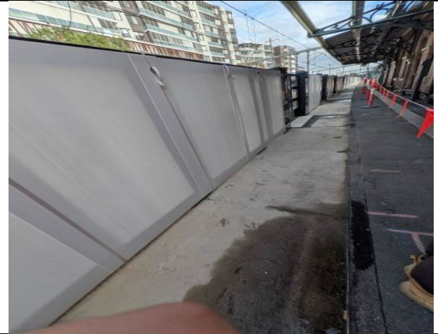
Figure 2 – Canterbury Station – Platform screen doors and mechanical gap fillers installation complete.