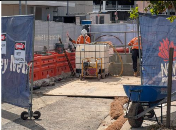
Figure 4 – Bankstown – Sewer works nearing completion at North Terrace.