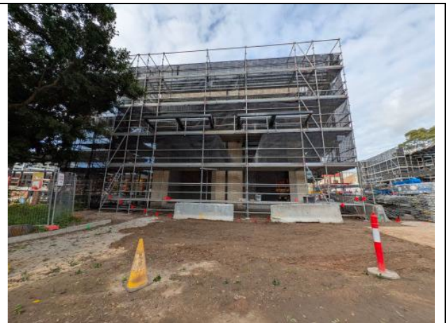
Figure 7 – Bankstown Station - Brick works and block works, roofing, utilities works ongoing on Sydney Trains side plaza areas.