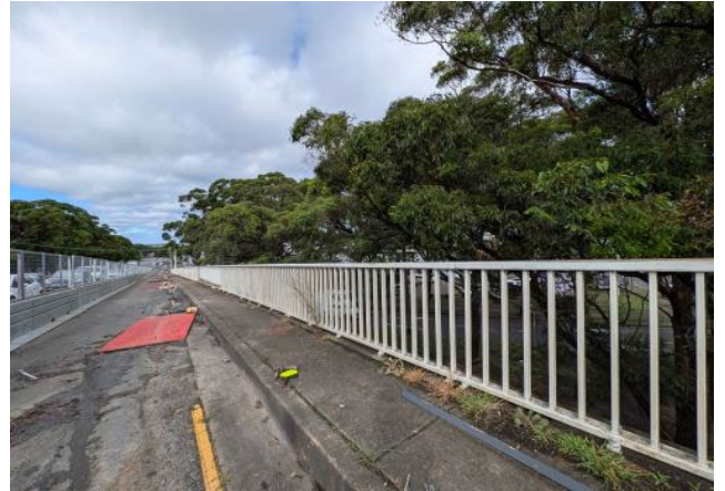
Figure 2 – Stacey St, Bankstown – Tree trimming required to support footpath widening activities, ecologist/arborist survey to be undertaken.