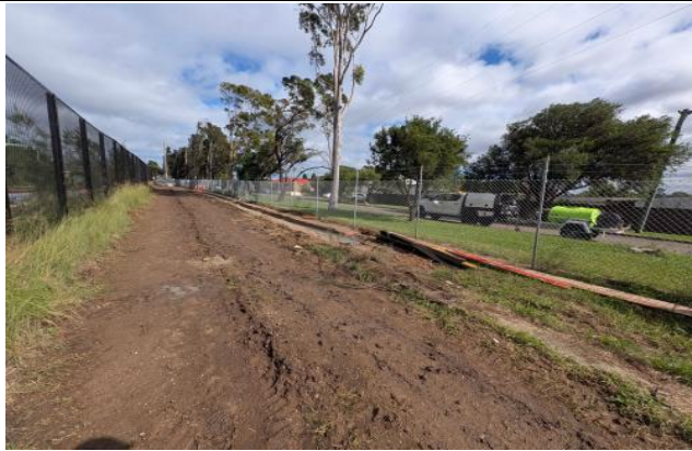
Figure 3 – Brande St/Urunga Parade (non-bridge) – concrete barrier works in progress.