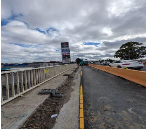
Figure 1 – Stacey St, Bankstown – Stage 2 of the hydro-demo works have been successfully completed. Site clean-up and footpath widening works in progress. Some tree branches pruning is required, arborist assessments underway.