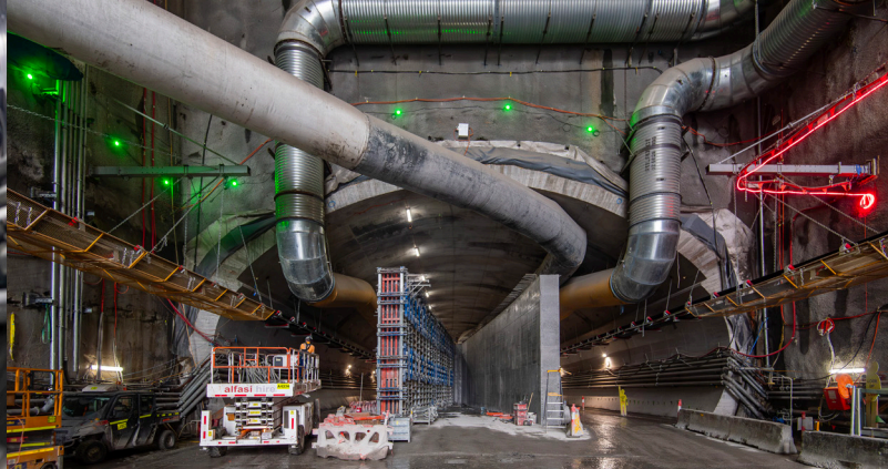
Tunnel between the Burwood North and North Strathfield station sites.