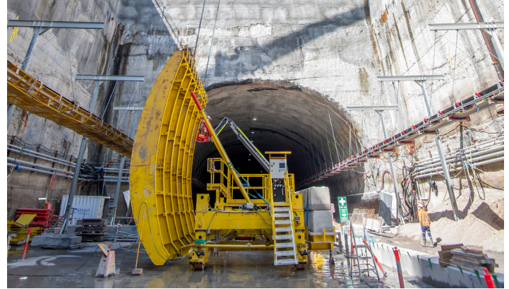
Formwork delivery and lift using a 250 tonne crane at the Five Dock station site.

Stage 3) will be completed in six (6) sections. The supporting beams within each section will be unbolted one segment at a time with all materials removed from site, before work starts on the next section.