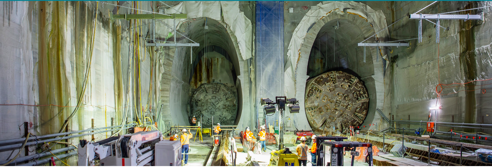
TBMs Beatrice and Daphne arriving into the Burwood North site