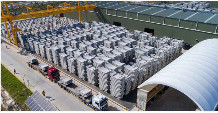
Eastern Creek Precast Facility