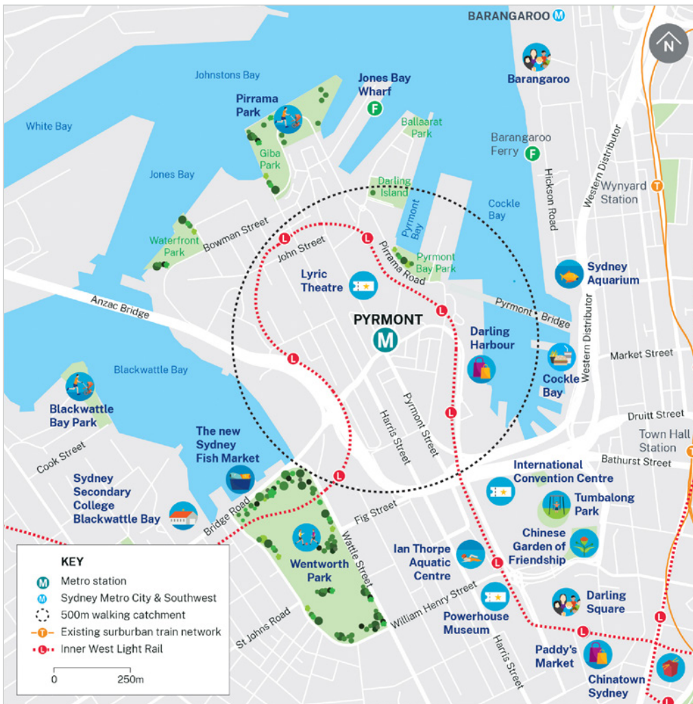
Pyrmont catchment map.