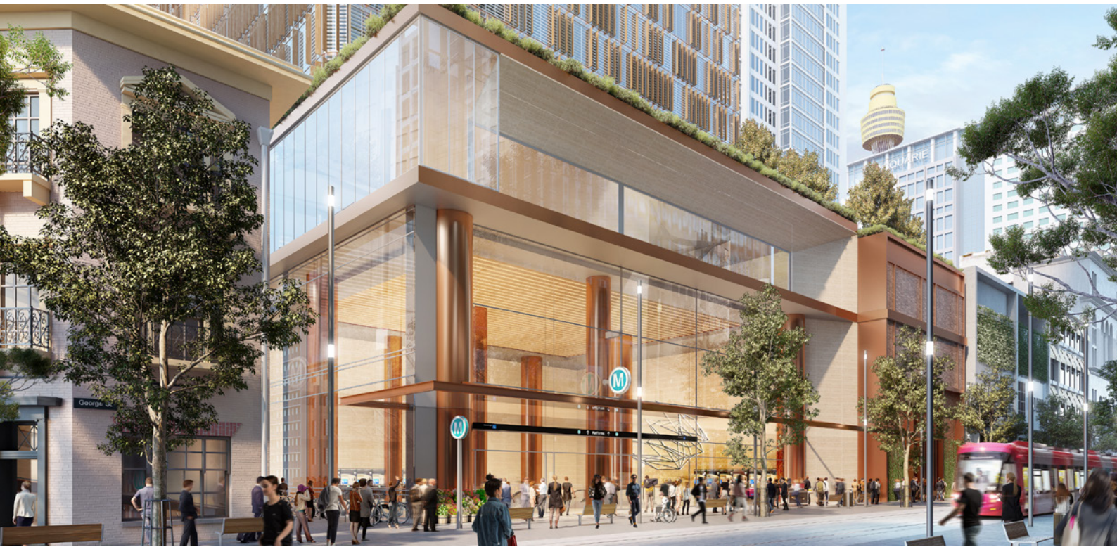
An artist's impression of Hunter Street metro station.