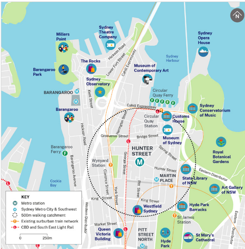
Hunter Street catchment map.