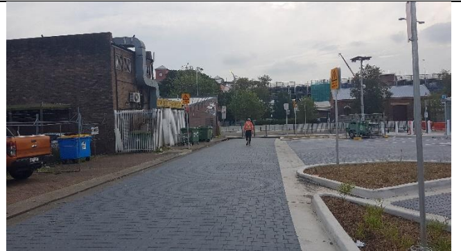
TBI view North along East Lane.