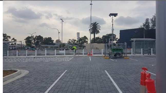
TBI view east – works completed.