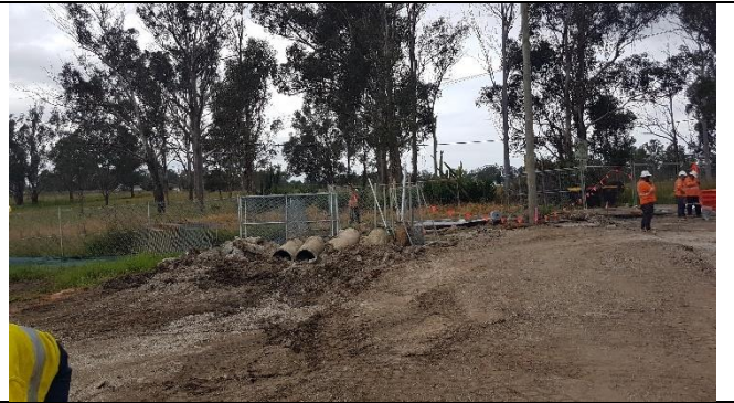
40 Derwent Road, Bringelly LIW view east – drainage structures repaved and driveway ready for concrete pour