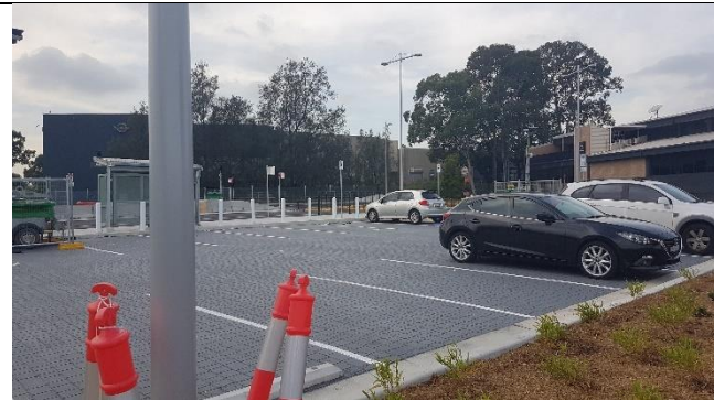
TBI view southeast from East Lane.