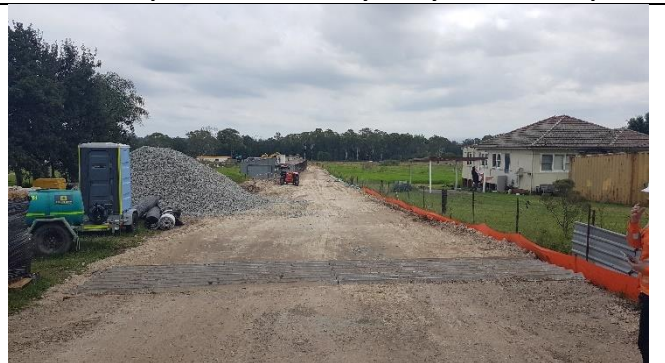
Power – View west of Lawson Road compound entry