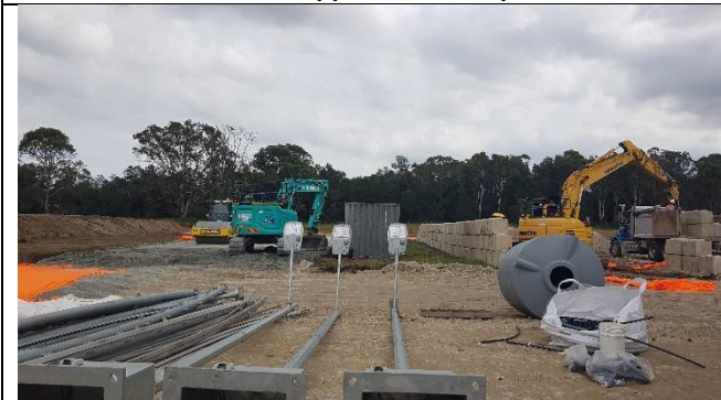
Power – View west of Lawson Road compound