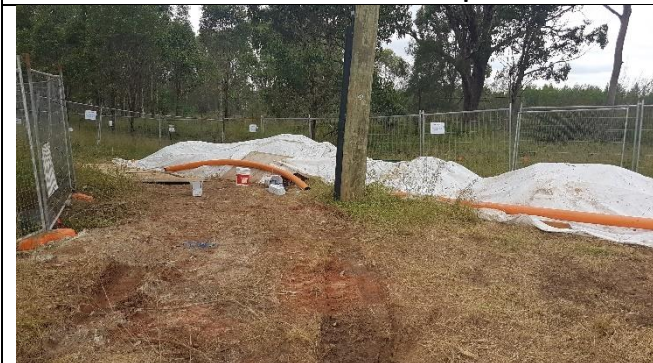
Power – View east of Patons lane conduit/under bore entry site with TPZ and Env. protection fencing.