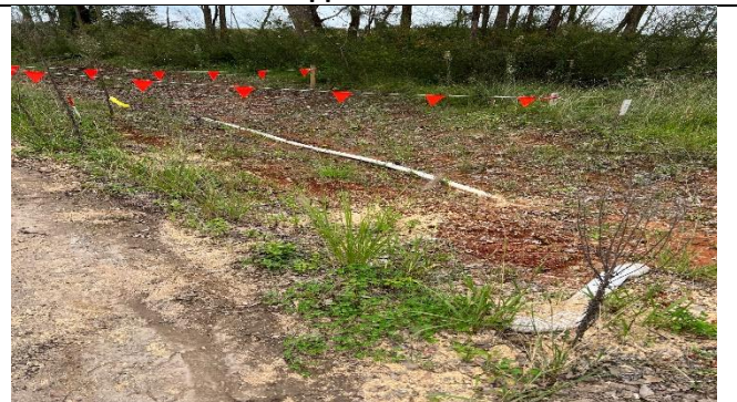
Patons lane - Spill booms used in clean-up of a diesel spill