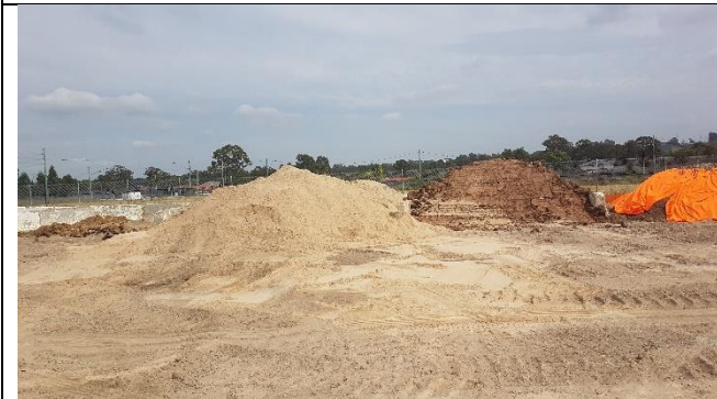
Power – View west of Gipps Street compound