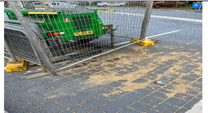
TBI minor spill cleaned-up near light tower.