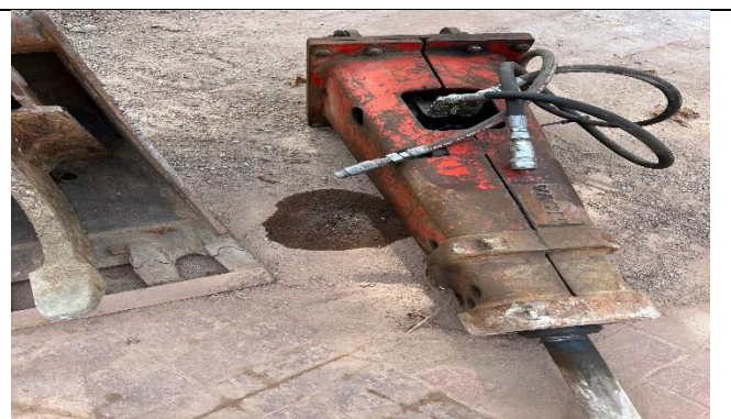
TBI stormwater realignment – Minor hydraulic spill.