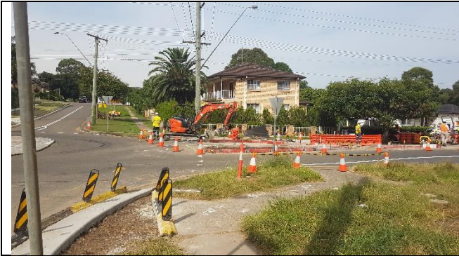
Western side of Philip and Lethbridge intersection works.