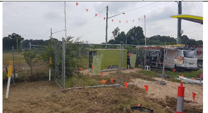
Power – View west of Gipps Street kiosk