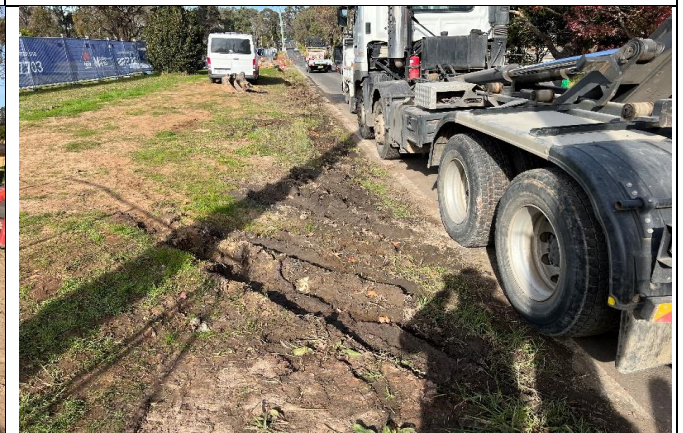
Power: Existing gutter on Kent Rd needs reinstating to a functioning water channel.