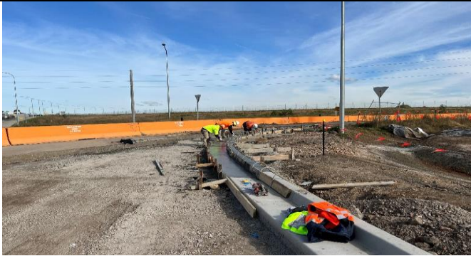
EDR: Road constructed to base course & kerb and gutter