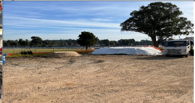
Power –Gipps Street compound tidy and well managed