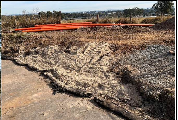
Power: Gravel bags at Caddens Rd bore to be refreshed