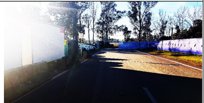
Bringelly Services Facility – Temporary Sheds installed.