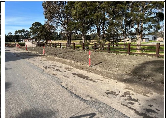
Power – Works on Cross Street complete, and disturbed areas seeded and soil binder applied