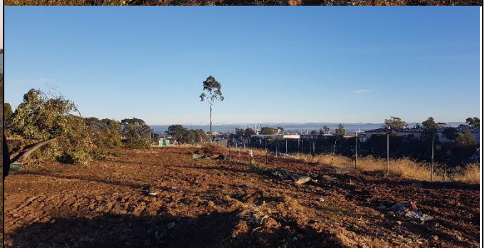
St Marys – Clearing and Grubbing between Glossop Street not compliant with Condition E92.