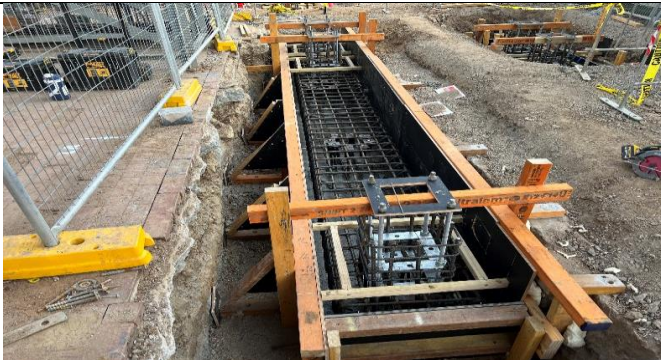
St Marys lift relocation: Stairs foundation FRP