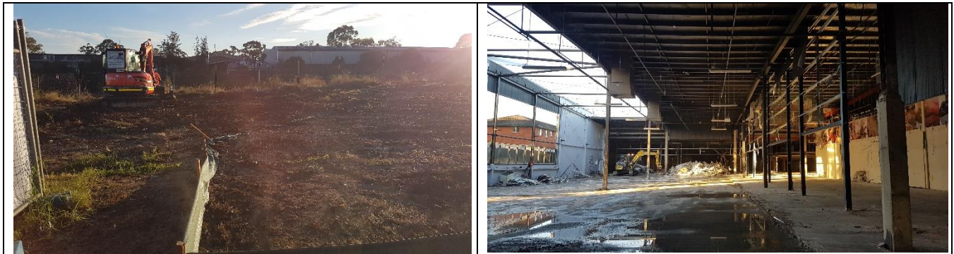
St Marys – Cleared Areas require improved Erosion and Sediment Control measures per the Blue Book.