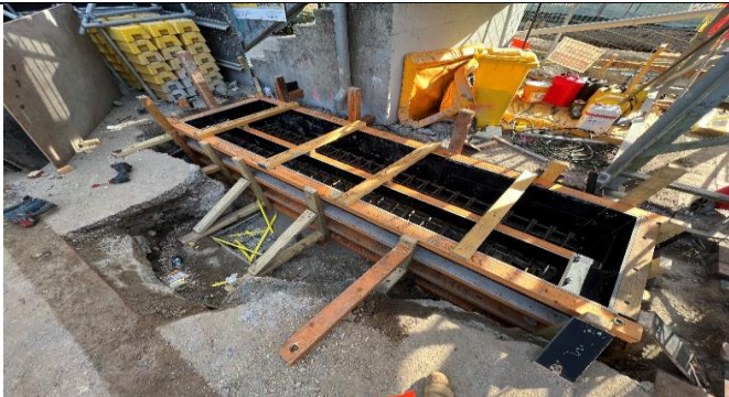
St Marys lift relocation: Suggested spill kit be moved to allow quick deployment.