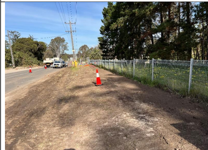
Power: Badgerys Creek Road sections now complete require soil binder prior to forecast rain