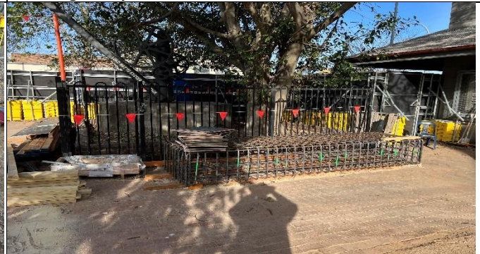
St Marys lift relocation: Considering additional pruning of fig tree