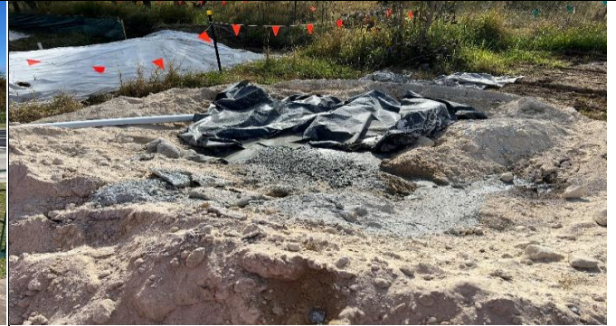
EDR: A concrete washout had been formed in excess sand, however, was not properly constructed