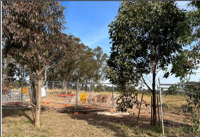
Power: Stockpile placed at the Caddens Rd bore needs appropriate erosion and sediment controls