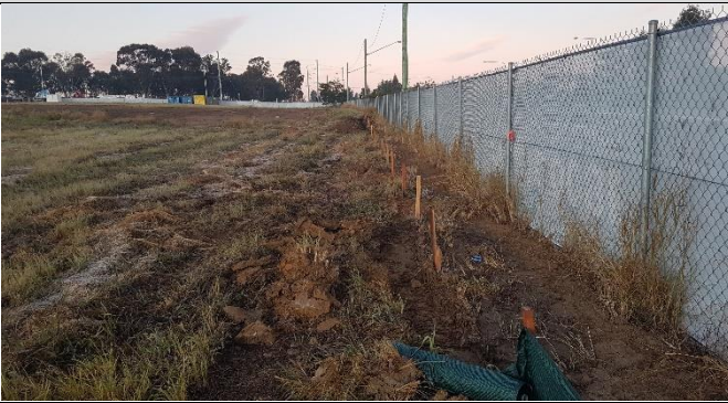
Claremont Meadows – Sediment fence incomplete along new Gipps St.