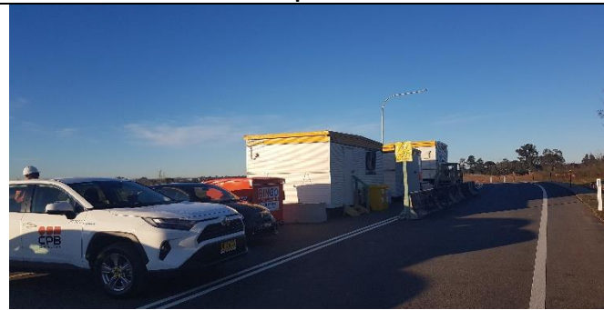
Aerotropolis - Temporary sheds set up on access road constructed by Transport for NSW outside the SSI