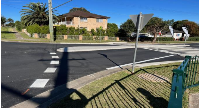
Philip and Lethbridge line marking completed