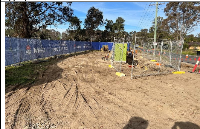
Power: The southern side of the Kent Rd site needs to be stabilised prior to the forecast rain and additional end of line controls installed