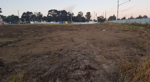
Claremont Meadows (view south)- Area of removal of legacy stockpile by Enviropacific to be stabilised