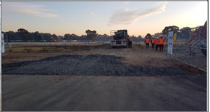
Claremont Meadows – Adequate Stabilised access and wheel wash required at southern entrance