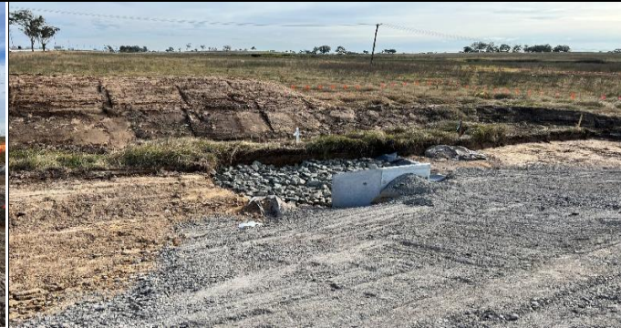
EDR: Stormwater drainage installed but not connected to existing flow paths.