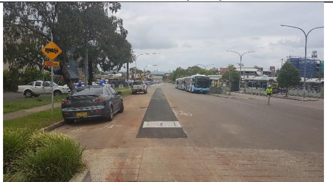
Station St view west - Services works conducted at night in sections. Well reinstated daily following night works.