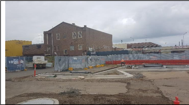
TBI view west to East Lane - Works mostly contained by concrete kerb and path works.