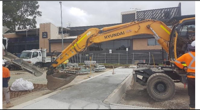
TBI view south - Pedestrian concrete footpaths and bus shelter islands mostly completed.