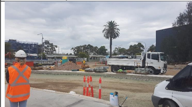
TBI view east - Turnaround areas being prepared for asphaltting