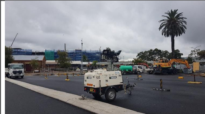
TBI view east – All areas asphalted