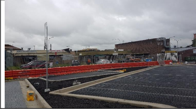
TBI view west to East Lane - Works completed including carpark. Lighting, security and landscaping remaining.