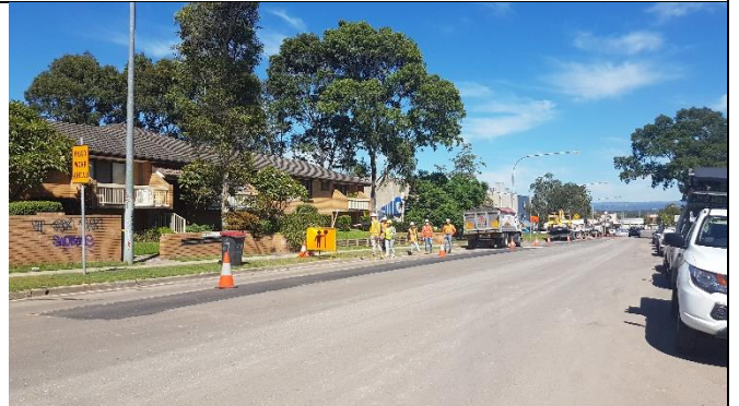
Station St view west - Services and resurfacing works conducted at night in sections. No complaints received.