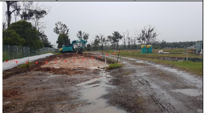
40 Derwent Road, Bringelly LIW view west – Demolition completed, and access upgrade commenced