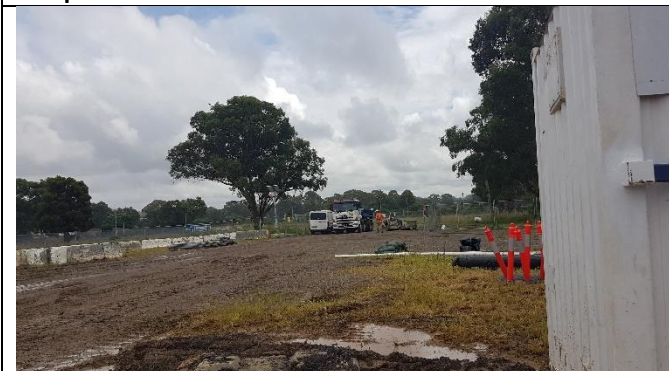
AEW Power – View North of establishment of 19 Gipps Street, Claremont Meadows compound