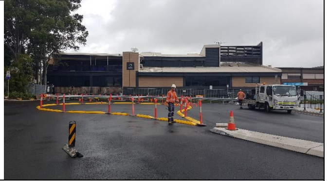
TBI view south – works completed (including turnaround) with the exception of lighting security and landscaping.