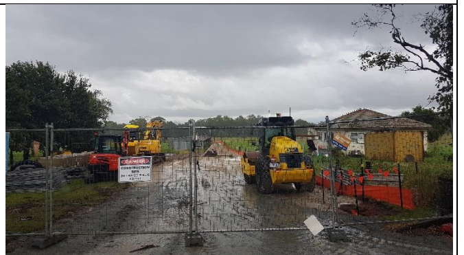
AEW Power – View West of establishment of 195 Lawson Road, Badgerys Creek compound