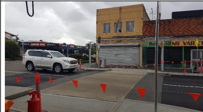
Queen Street at Station St. - Pedestrian crossing completed under ROL over 72 hours on a weekend. No complaints.