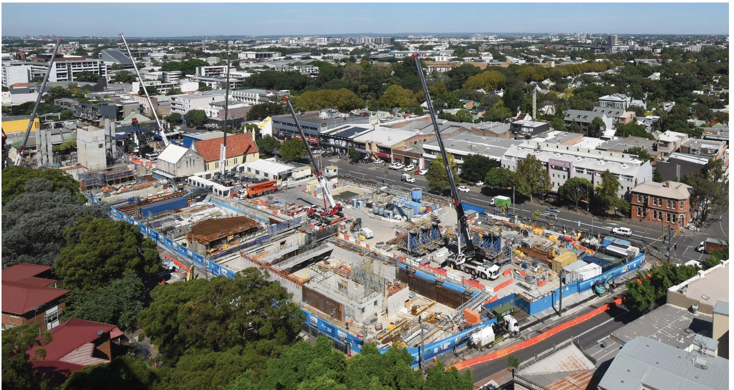
Overview of Waterloo Station site bounded by Botany Road, Cope, Raglan and Wellington streets.

It is essential that Sydney Metro proceed with these additional work hours. Without the additional working hours, Sydney Metro will remain on site completing works for an overall longer period of time.