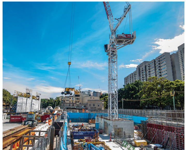
Construction works on the surface level at Waterloo station.

If you have any feedback or questions about this work, please contact waterloometro@transport.nsw.gov.au or phone 1800 171 386 .