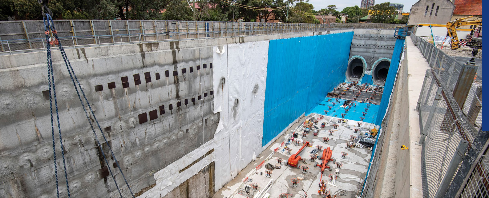
Piling works, waterproofing and preparation for concrete pour continue at the Waterloo Station site.