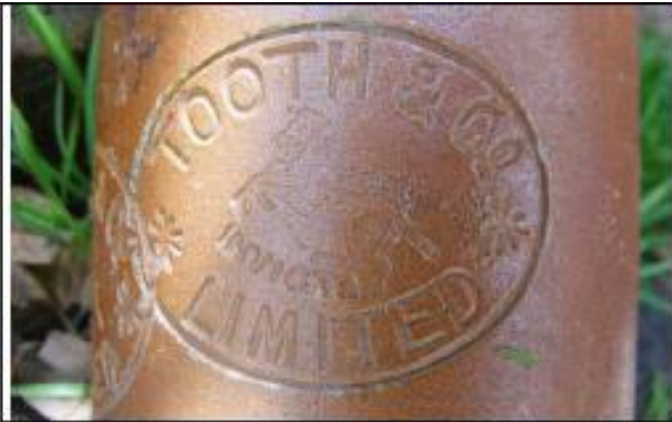
Figure 4: Detail of the stamp allows 'Tooth & Co Limited' to be made out. This is helpful to a specialist in gauging the artefact's origin, manufacturing date and likely significance.