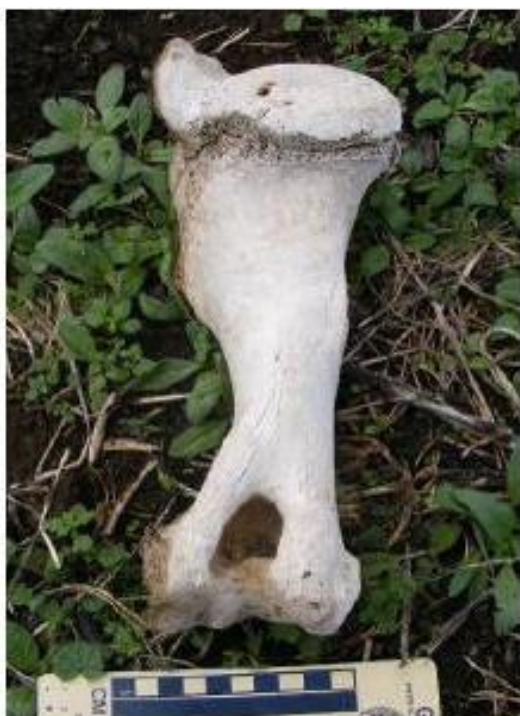
Figure 7: Photograph showing complete bone.

be identified from the photograph alone. They show sufficient detail of the complete bone and the epiphysis.