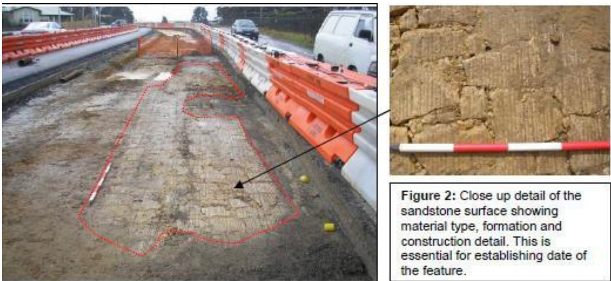
Figure 2: Close up detail of the sandstone surface showing material type, formation and construction detail. This is essential for establishing date of the feature.

Where unexpected items have a distinguishing feature, close up detailed photographs must be taken of these features, where practicable. In the case of a building or bridge, this may include diagnostic details architectural or technical features. See Figures 3 and 4 for examples.