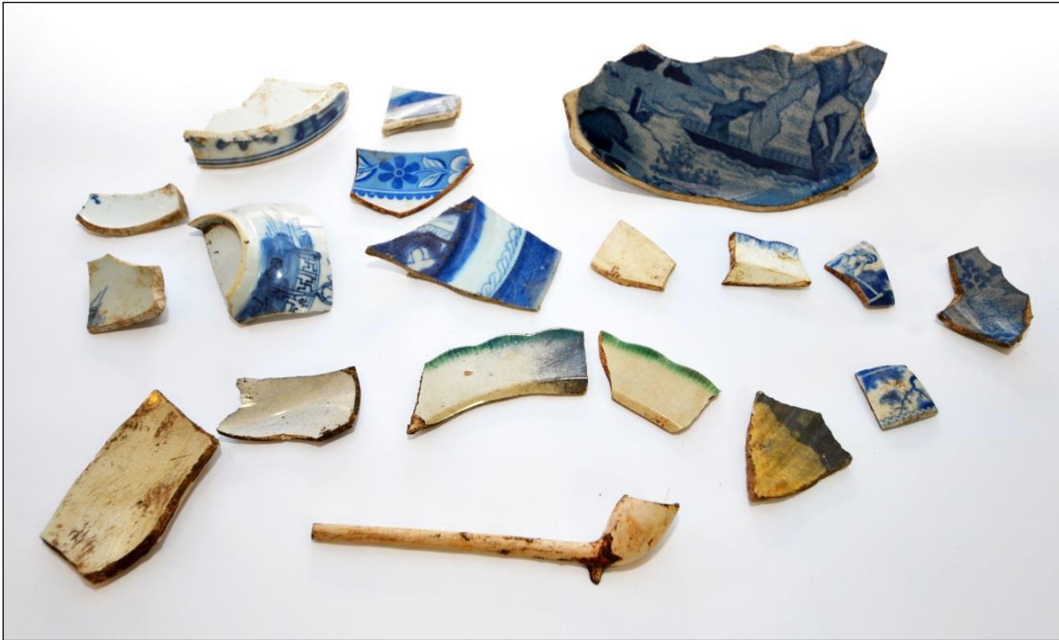
Plate 7: Chinese Ming Dynasty pottery and English porcelain / pottery dating back to the early nineteenth century, Wynyard Walk project, 2014