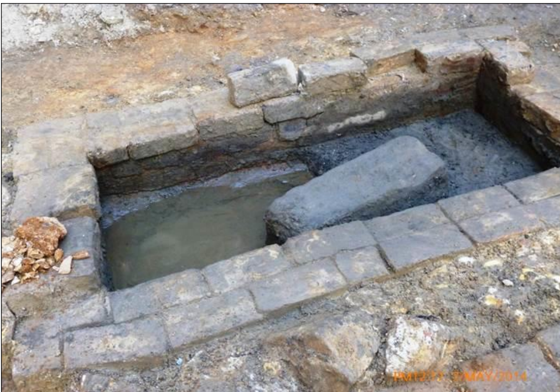
Plate 6: Sandstone flagging and cesspit, Wynyard Walk project, 2014