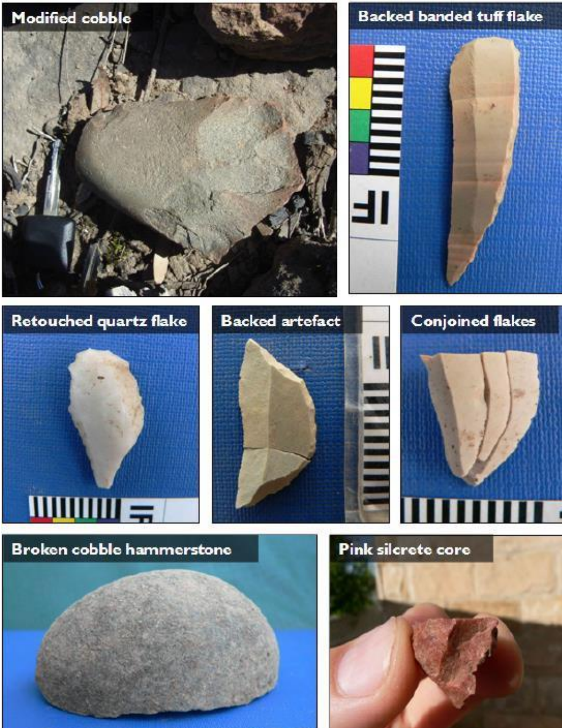
Plate 10: Culturally modified stone discovered on Main Road 92, about two kilometres west of Sassafras. The remaining images shown a selection of stone artefacts retrieved from test and salvage archaeological excavations during the Hume Highway Duplication and Bypass projects from 2006-2010.