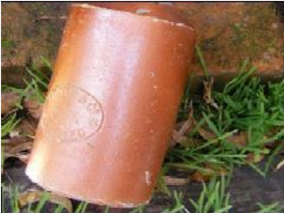
Figure 3: Ceramic bottle artefact with stamp.