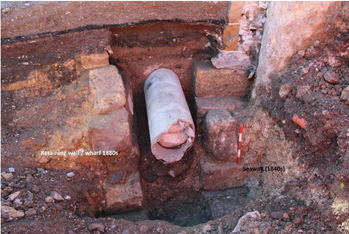
Plate 3: 1840s seawall and 1880s retaining wall uncovered at Balmain East, 2016