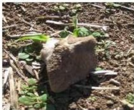
Figure 6: Bone covered in sediment

Ensure that all close up photographs include the whole bone and then specific details of the bone (especially the ends of long bones, the epiphysis , which is critical for species identification). Figures 7 and 8 are examples of good photographs of bones that can easily