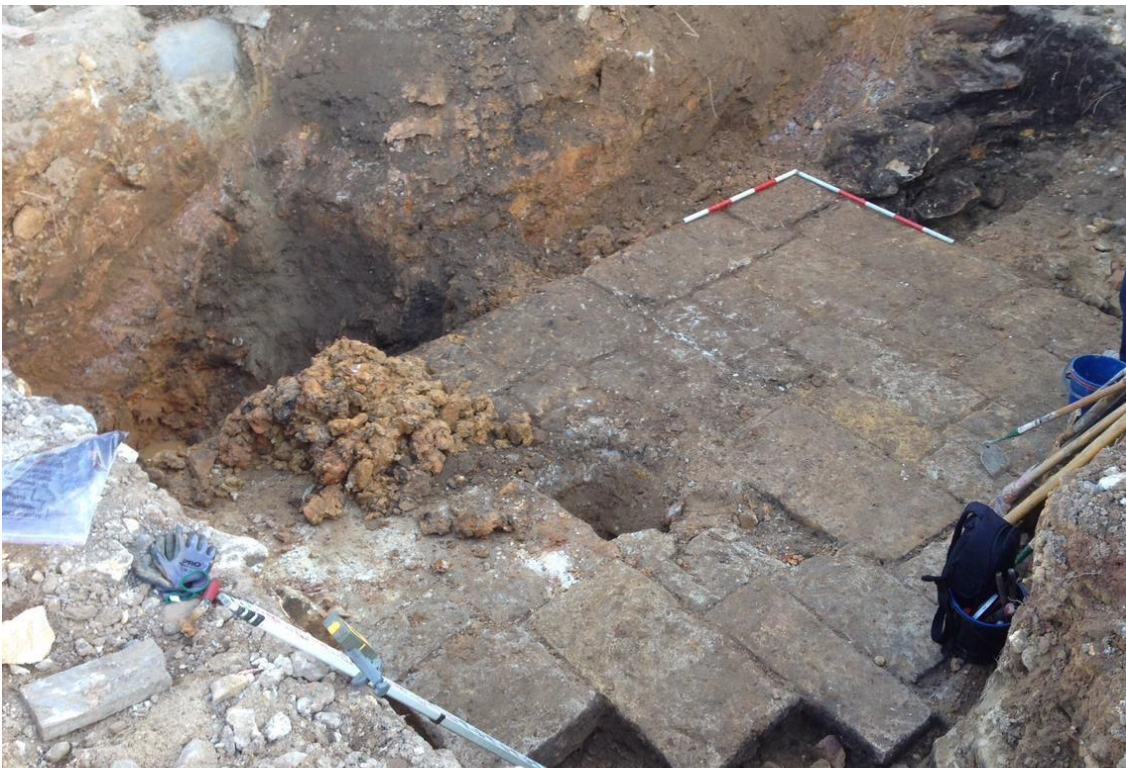
Plate 4: Sandstone pavers uncovered at Balmain East, 2016