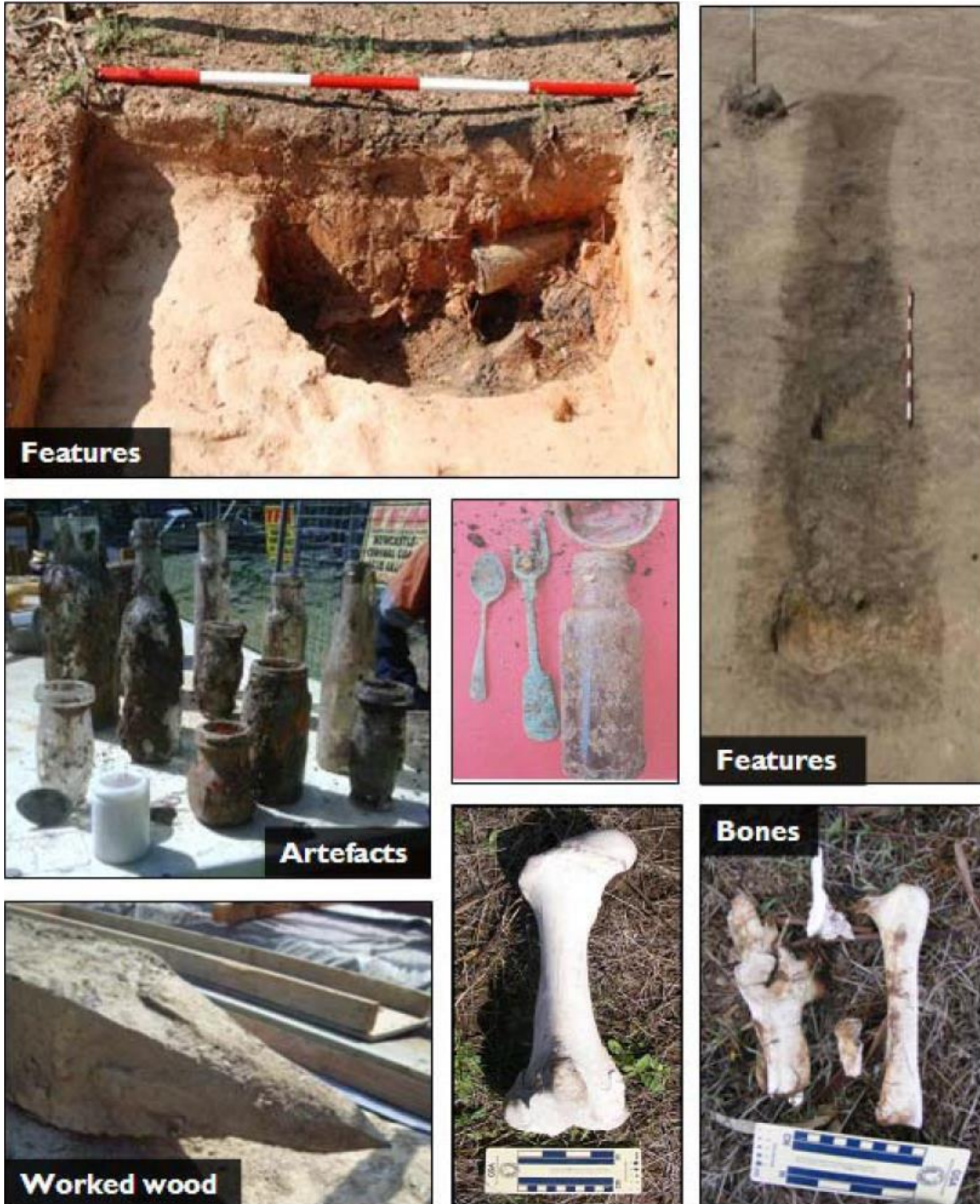
Plate 9: Top left hand picture continuing clockwise: Stock camp remnants (Hume Highway Bypass at Tarcutta); linear archaeological feature with post holes (Hume Highway Duplication), animal bones (Hume Highway Bypass at Woomargama); cut wooden stake; glass jars, bottles, spoon and fork recovered from refuse pit associated with a Newcastle Hotel (Pacific Highway, Adamstown Heights, Newcastle area)

The following images, obtained from the Roads and Maritime Services Unexpected Heritage Items Heritage Procedure 02.