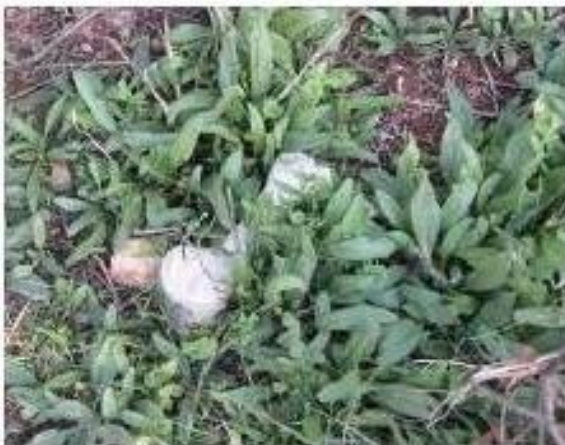
Figure 5: Bone concealed by foliage.

Where sediment (adhering to a bone found on the ground surface) conceals portions of a bone (Figure 6) ensure the photograph is taken of the bone (if any) that is not concealed by sediment.