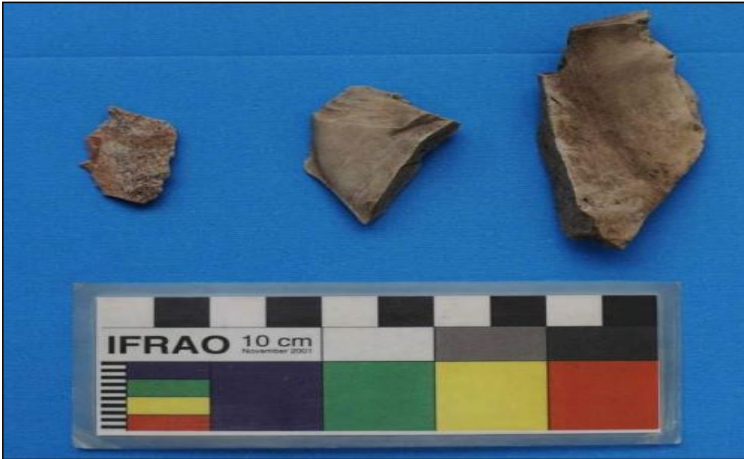
Plate 1: Aboriginal stone artefacts found at the Wickham Transport Interchange, 2015