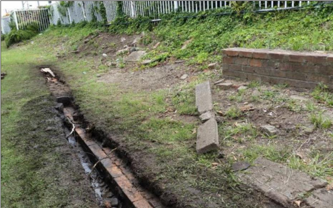
Plate 5: Platform at Hamilton Station classified as a ‘work’ by the project archaeologist, Wickham Transport Interchange project, 2015