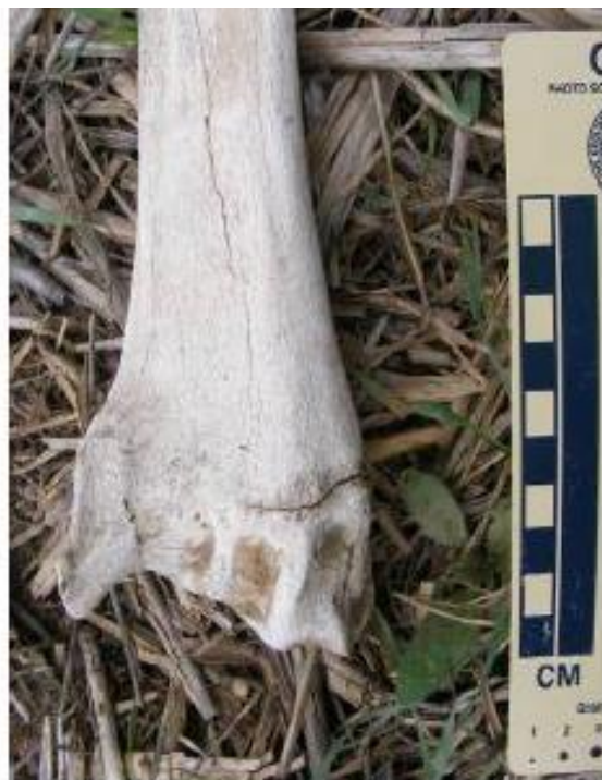
Figure 8: Close up of a long bone's epiphysis.