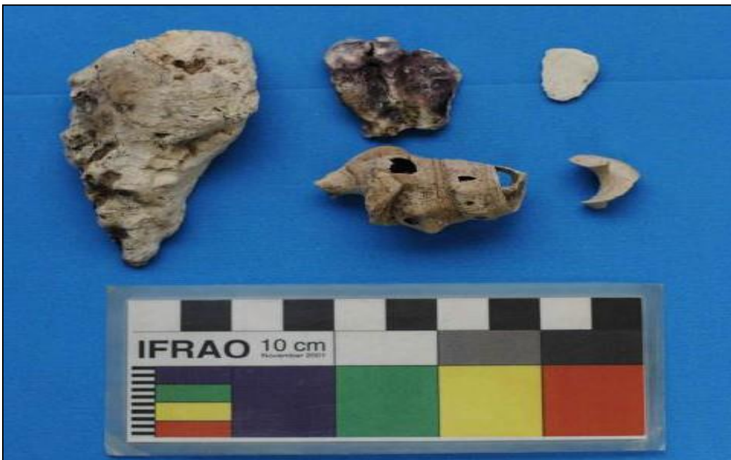
Plate 2: Aboriginal artefacts (shell material) found at the Wickham Transport Interchange, 2015