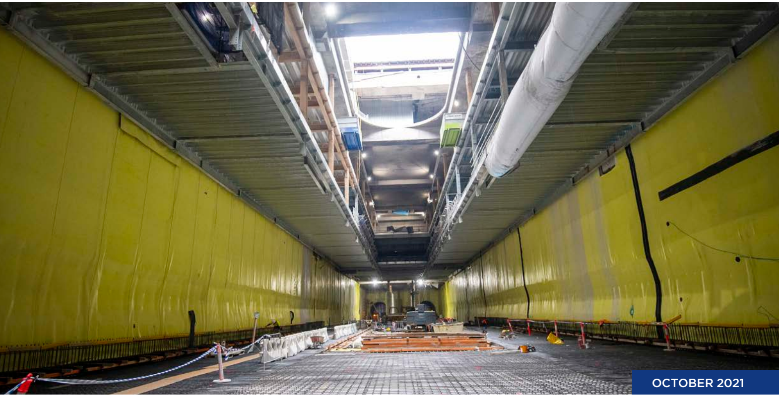
Completed excavation in the metro box.