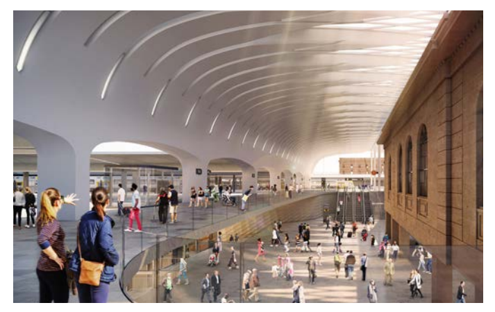
An artist's impression of the upper Northern Concourse.

Once the formwork is removed, the finishes teams will start their work across the area, and the new concourse will take shape for the public to use.