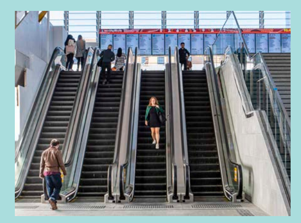
New escalators at Central.

Across the station, there are also 14 new lifts being installed at Central. This includes lifts from the metro platforms to the North-South Concourse, from Central Walk to the suburban platforms - in the upper and lower Northern Concourse, at the new Chalmers Street entrance, and in the Eastern Suburbs Railway Concourse.