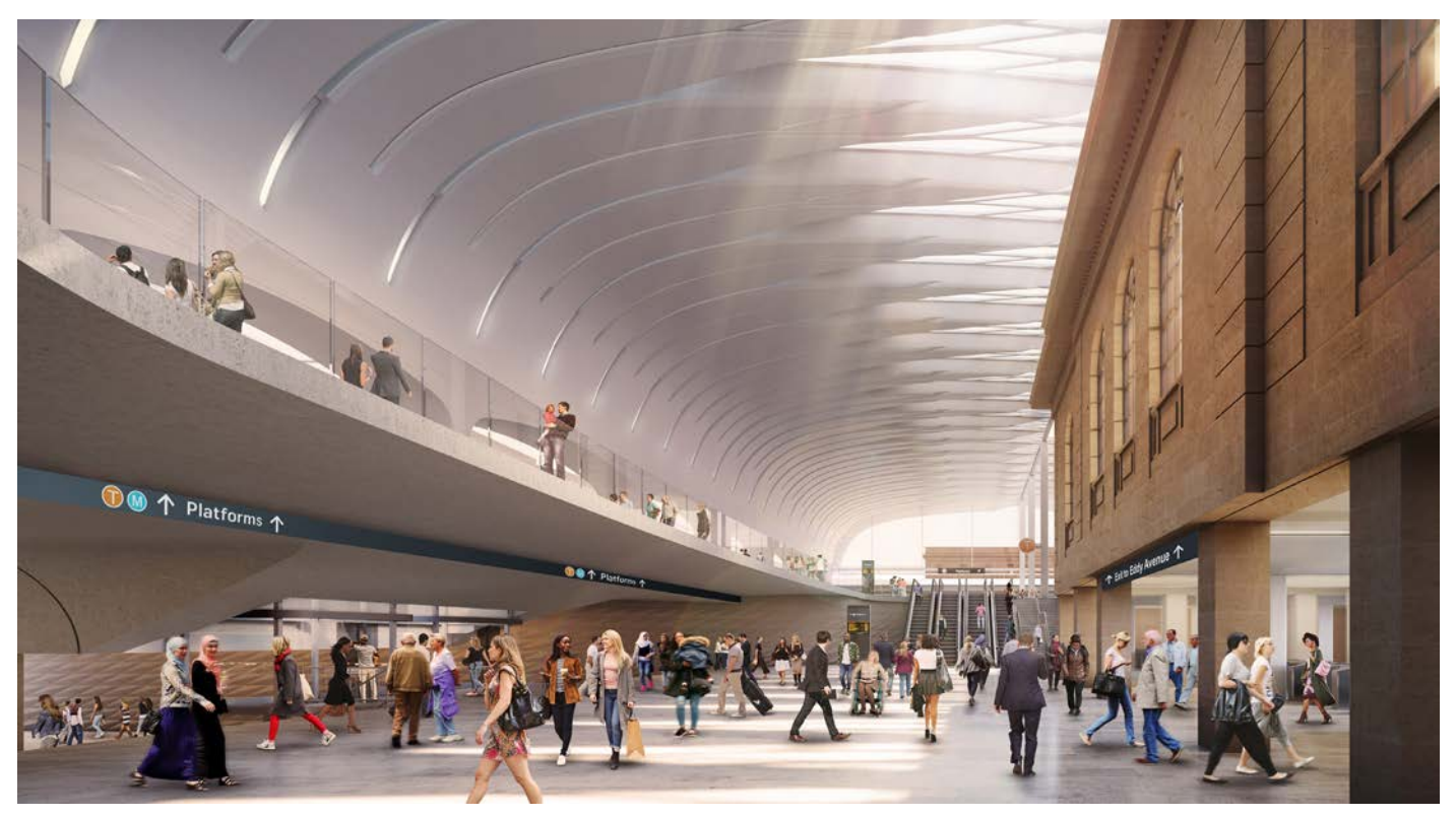
An artist's impression of the lower Northern Concourse, with the new cantilever slab on the left.