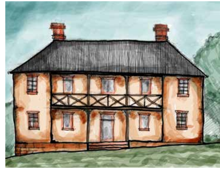
Artist's impression of the White Hart Inn (circa 1840).

The Royal Oak Inn (now the Mean Fiddler) was constructed in the late 1820s specifically as a Cobb and Co coach inn, which ran a route from Parramatta to Windsor.