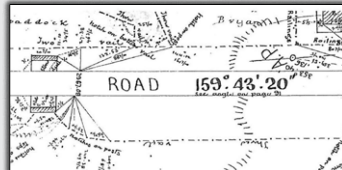
1881 resurvey of Windsor Road.

Europeans were not the first people to inhabit the Hills Shire. Aboriginal groups have been living in this area for thousands of years before white settlement. The group in this area is called the Darug. The Kellyville area was set aside as a government farm before being opened for private settlement in the early 1800s. It grew slowly and for many years Kellyville remained a place to pass through on a journey to somewhere else such as Windsor or the Hawkesbury and was not a place where people lived. Houses were scattered along the main roads, such as Windsor and Old Windsor roads, but there were no distinct towns or villages between Castle Hill and Windsor. Kellyville was often referred to as 'there or nowhere', 'nowhere here' or 'there and nowhere else'.