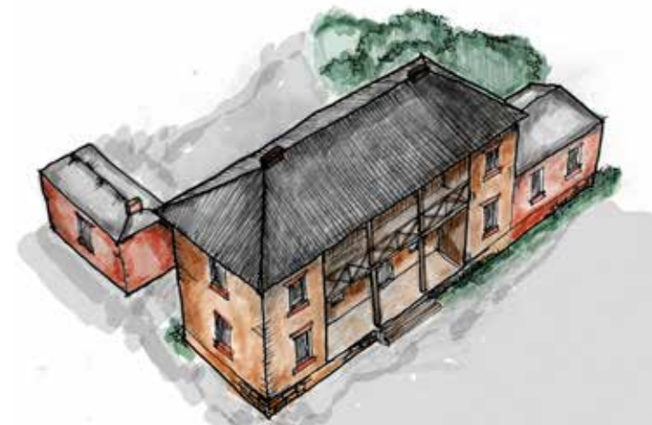
Artist's impression of the White Hart Inn (circa 1840).

As the colony became more established, the design of inns changed to two-storey buildings constructed of brick or stone. Many inns had developed to include coffee rooms, parlours, full stables and undercover coach parking .