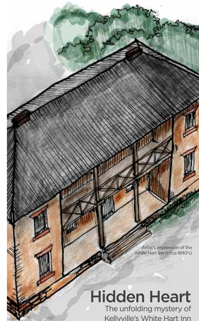
Artist's impression of the White Hart Inn (circa 1840's)

www.sydneymetro.info info@metronorthwest.com.au 1800 019 989 www.facebook.com/SydneyMetro