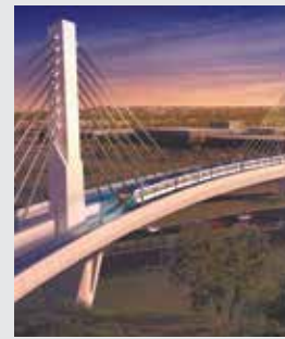
The skytrain over Windsor Road at Rouse Hill

Sydney Metro is the largest public transport infrastructure project currently under construction in Australia.