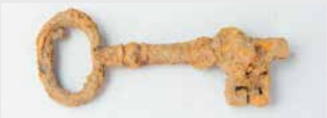
Key found on site.