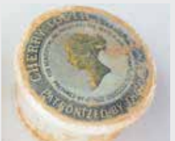
A toothpaste canister lid.

Other finds include a salt cellar and complete ceramic toothpaste container, and coins from 1813 and 1853. Children's toys, a doll's leg, buttons and numerous fragments of pipe stems have also been recovered during the test excavation.