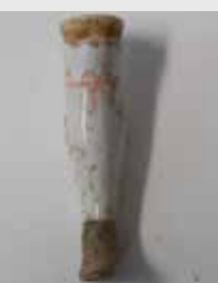
A doll's leg.