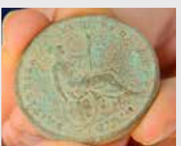
Coins that are almost 200 years old.