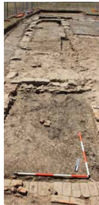
Front of the inn.

The inn then becomes difficult to trace in historical records. Perhaps the site was used as a family home, before being demolished.