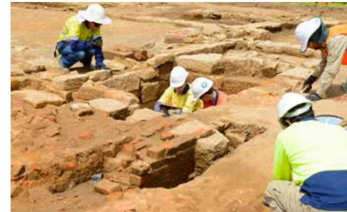
Archaeologists working at the White Hart Inn.