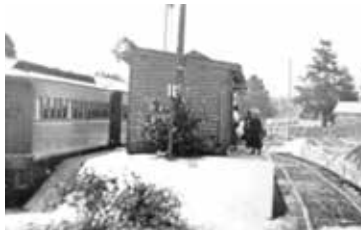
Rogans Hill Railway Station (circa 1930).

However, the railway did not come into Rogans Hill to the south until the 1930s and both Windsor and Old Windsor Roads would have remained major travel routes through the nineteenth century.