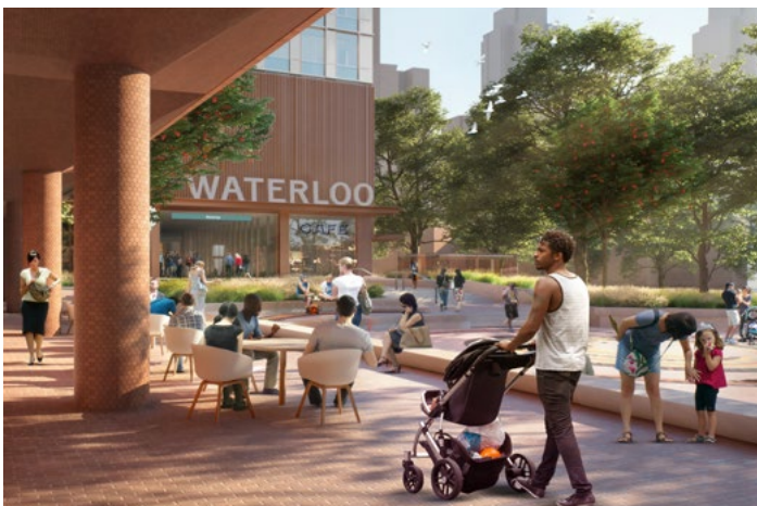
An artist's impression of the Cope Street plaza looking towards one of the entrances to the new metro station.

You will have an opportunity to make a formal submission to DPIE during the public exhibition period. The planning process timeline to the right highlights where we are up to.