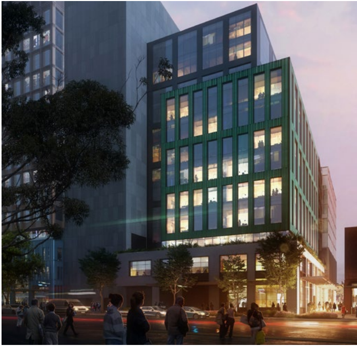
An artist's impression of the new office building from Botany Road and Grit Lane which is a pedestrian link to the Cope Street plaza.