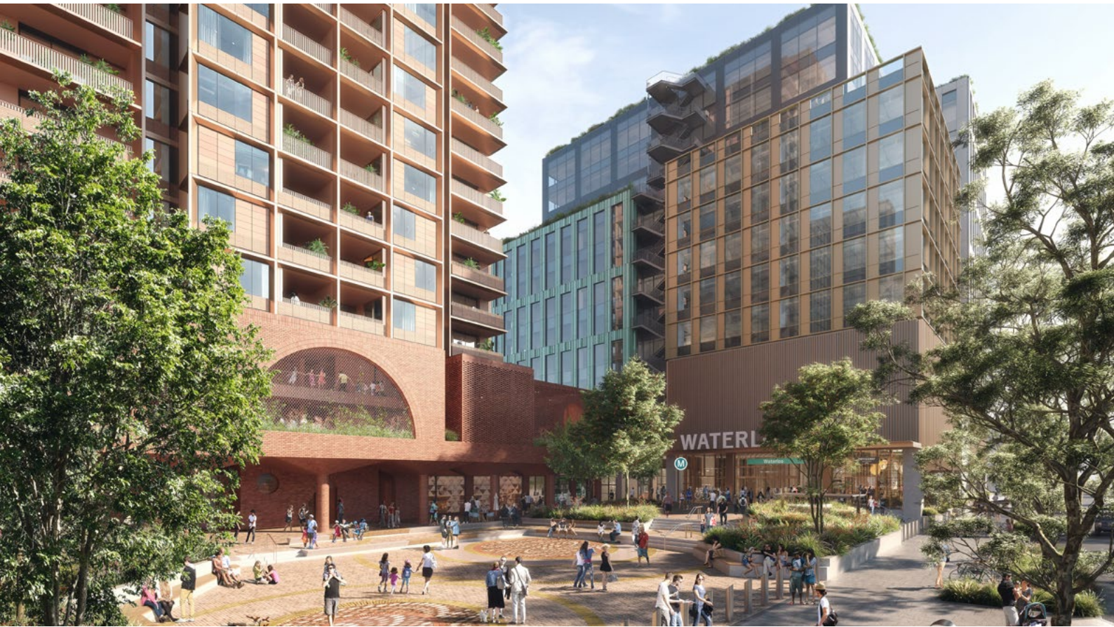
An artist's impression of the Waterloo Metro Quarter residential (left), commercial buildings (right rear) and metro station southern entrance (right front) looking northwest across Cope Street plaza.