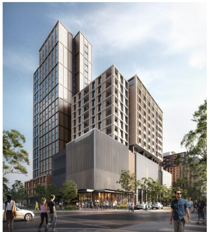
An artist's impression of the Waterloo Metro Quarter social housing building above the metro station southern entrance and student accommodation building (left) looking north from Cope Street at the Wellington Street intersection.

A project overview booklet will also be available for download at http://www.wisd.com.au/planning process .