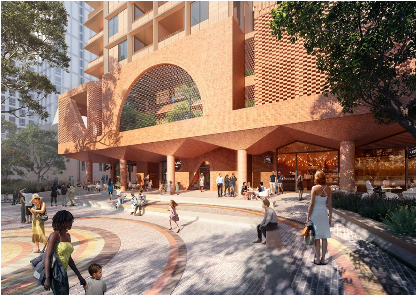
An artist's impression of the Waterloo Metro Quarter residential building looking southwest from Cope Street plaza.