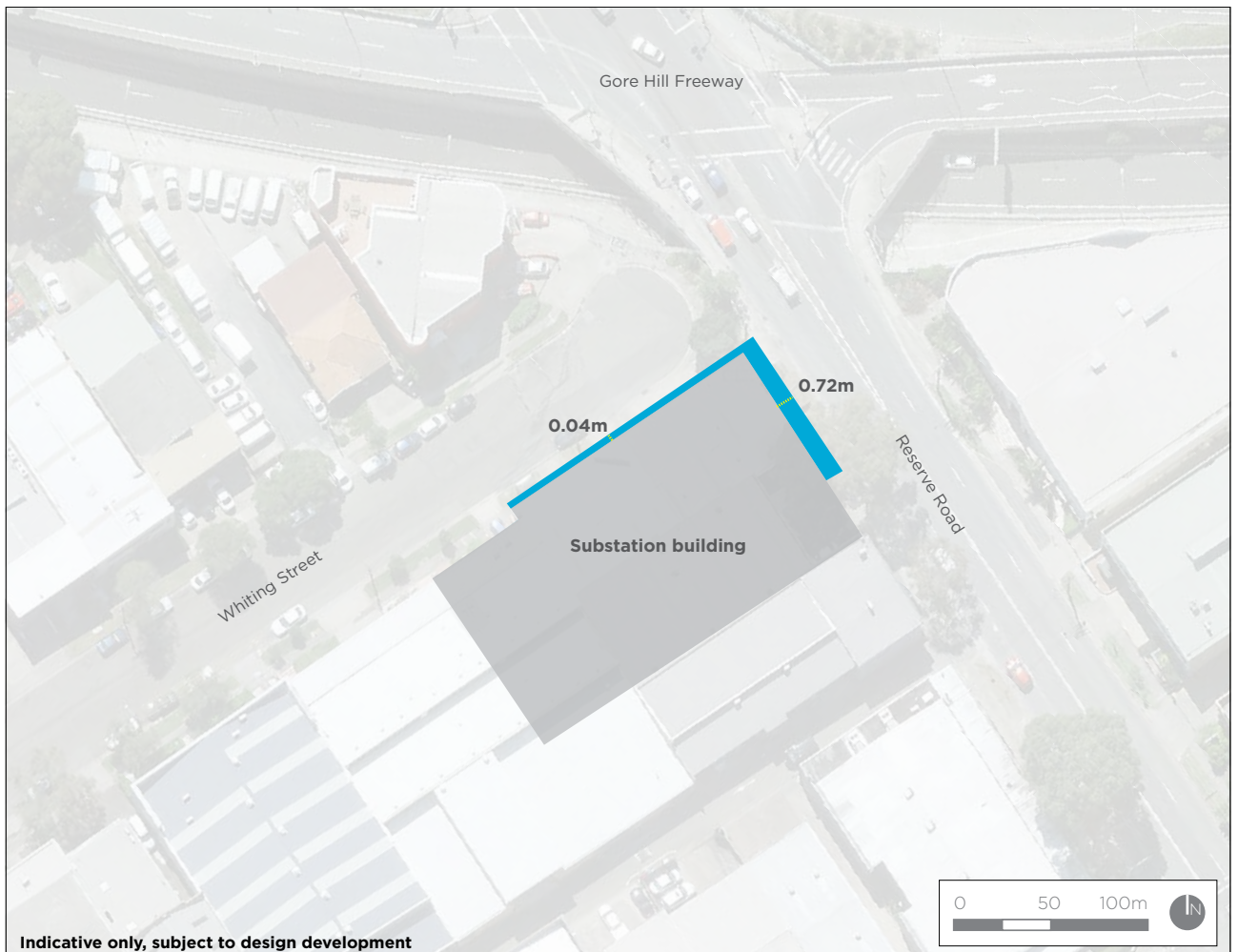
Figure 2-4 Revised setbacks – Artarmon substation

The proposed setbacks to both Reserve Road and Whiting Street are less than those specified by the Willoughby Development Control Plan , which are three metres and 1.5 metres respectively. This variation is considered justified in order to limit the building height to two storeys and maintain a consistent height with nearby reference buildings. It is also noted that the existing building does not comply with the setbacks specified by the Willoughby Development Control Plan . The visual impact of the proposed substation building would be minimised through the design of an appropriate architectural treatment of the façades.