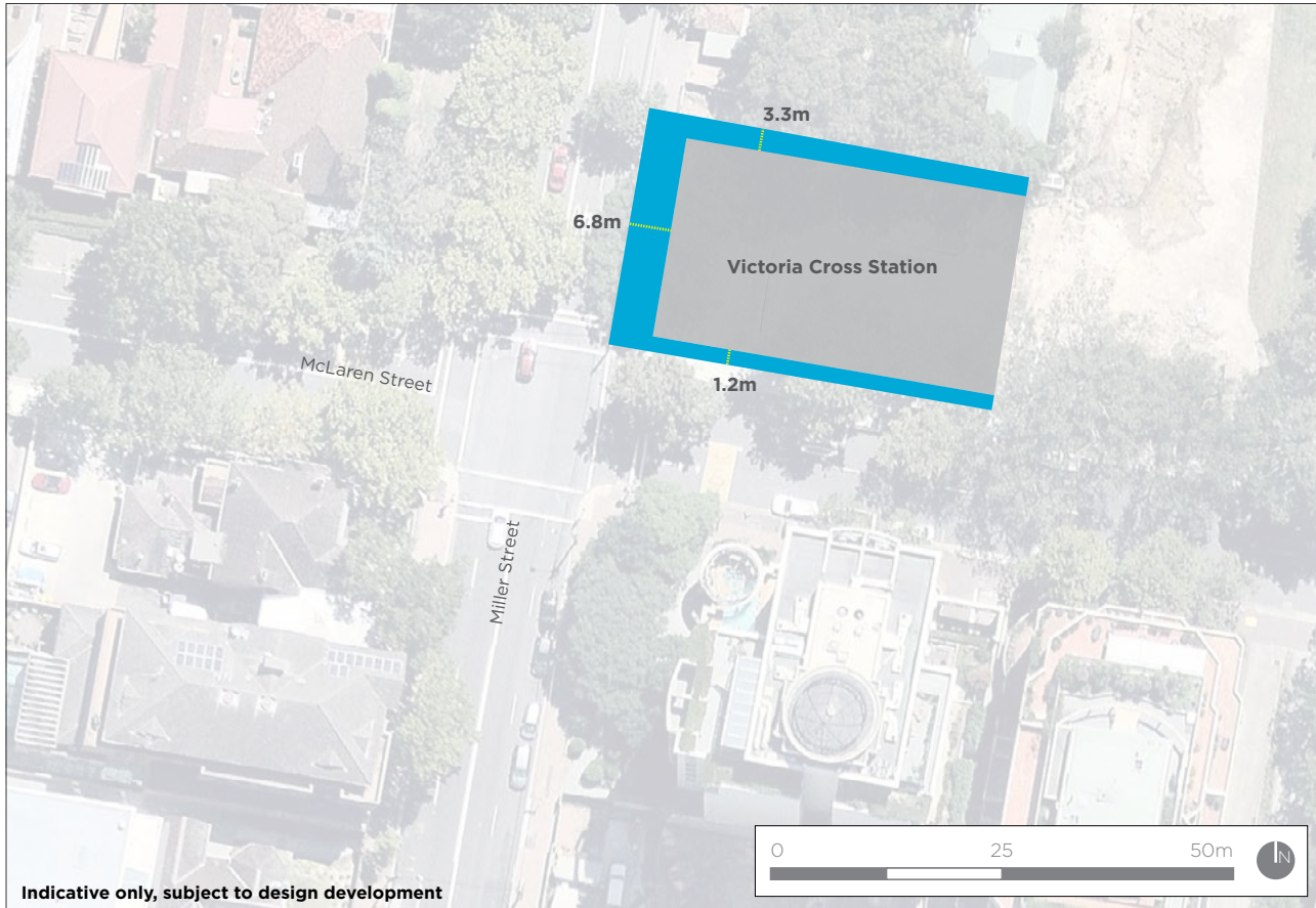
Figure 2-2 Revised setbacks – Victoria Cross Station