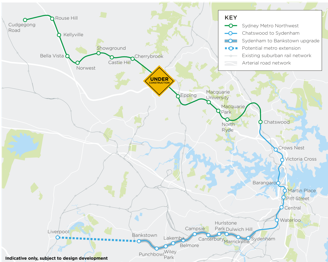
Figure 1-1 The Sydney Metro network