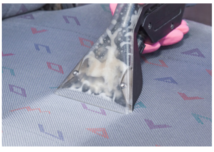
Cleaning fabric seats with a wet vacuum.