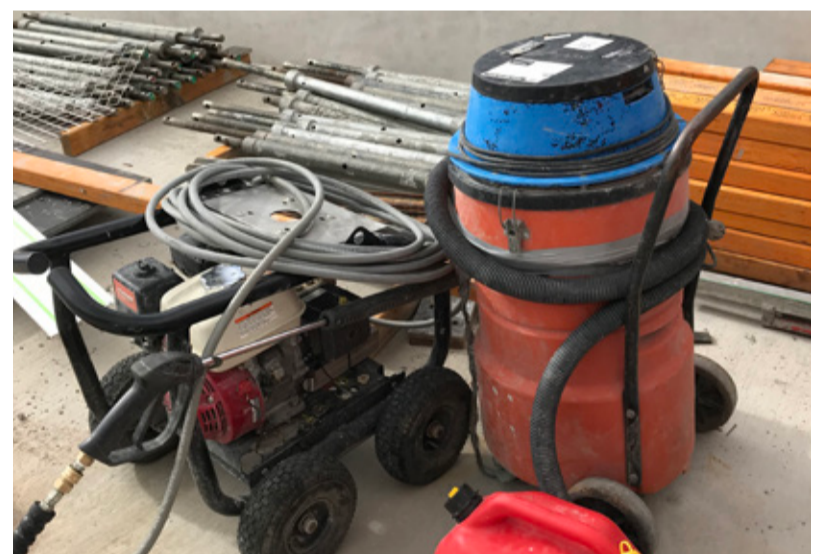
Gernie and wet vacuum.