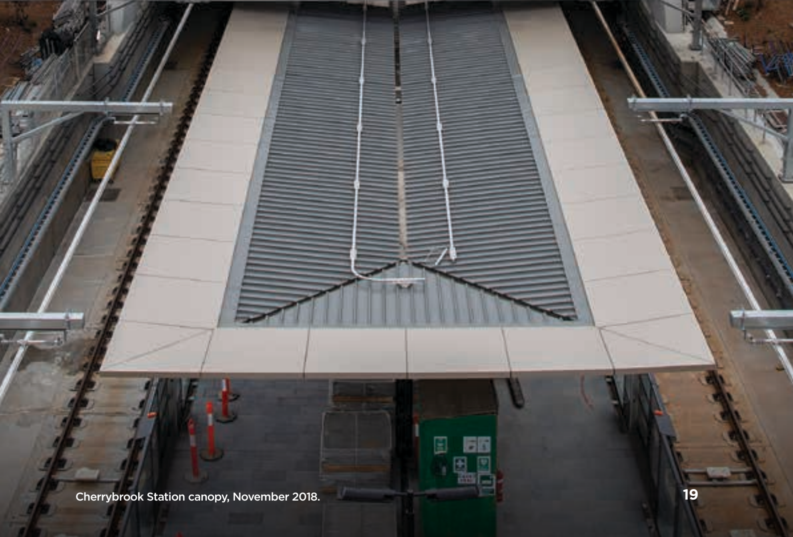
Cherrybrook Station canopy, November 2018.