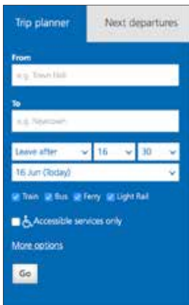
Figure 14: Plan your trip.

What types of transport would you currently use for these trips?