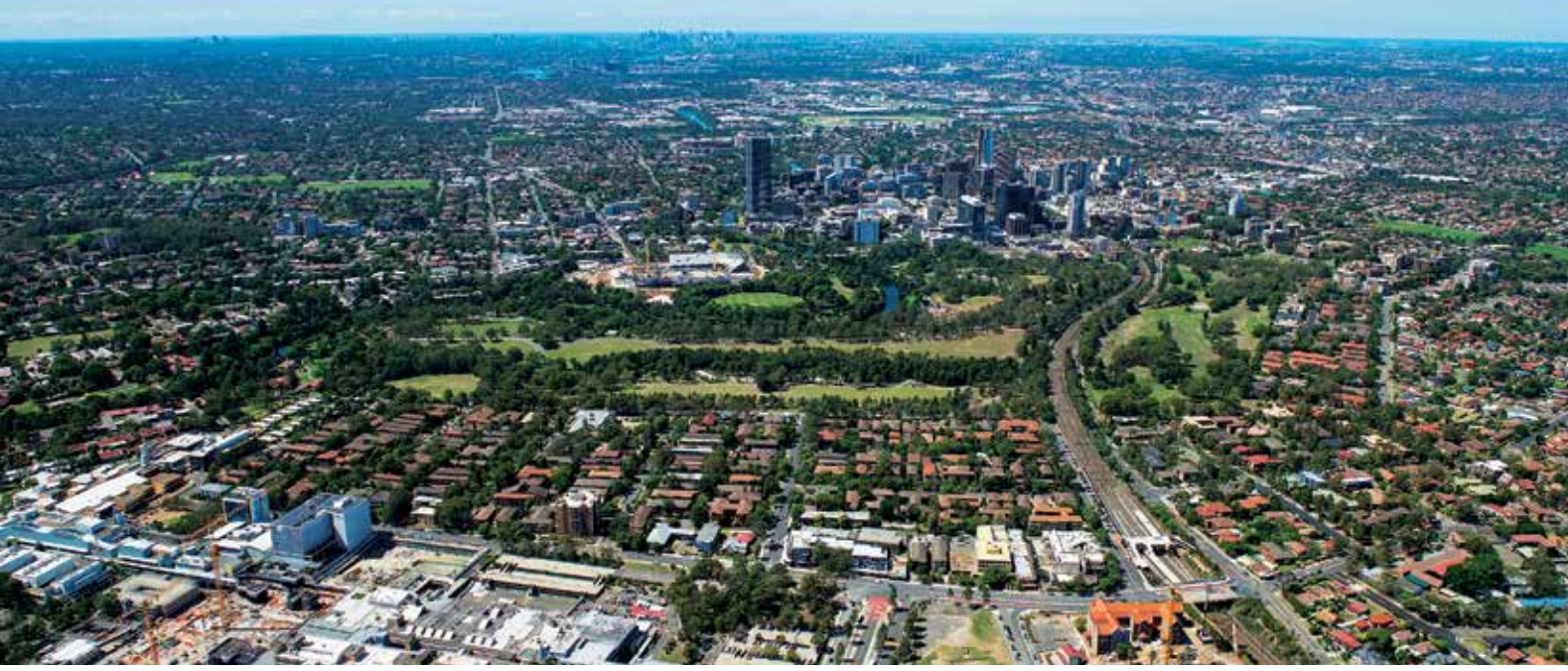
Westmead health precinct and Parramatta central business district (CBD), with Sydney CBD in the distance