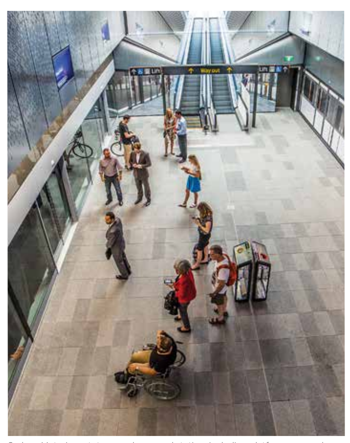
Sydney Metro's prototype underground station, including platform screen doors

With customers at the centre of all design decisions, stations will be fully accessible and quick and easy to get in and out of; trains will be fast, safe and reliable; and technology will keep people connected at every step of the journey.