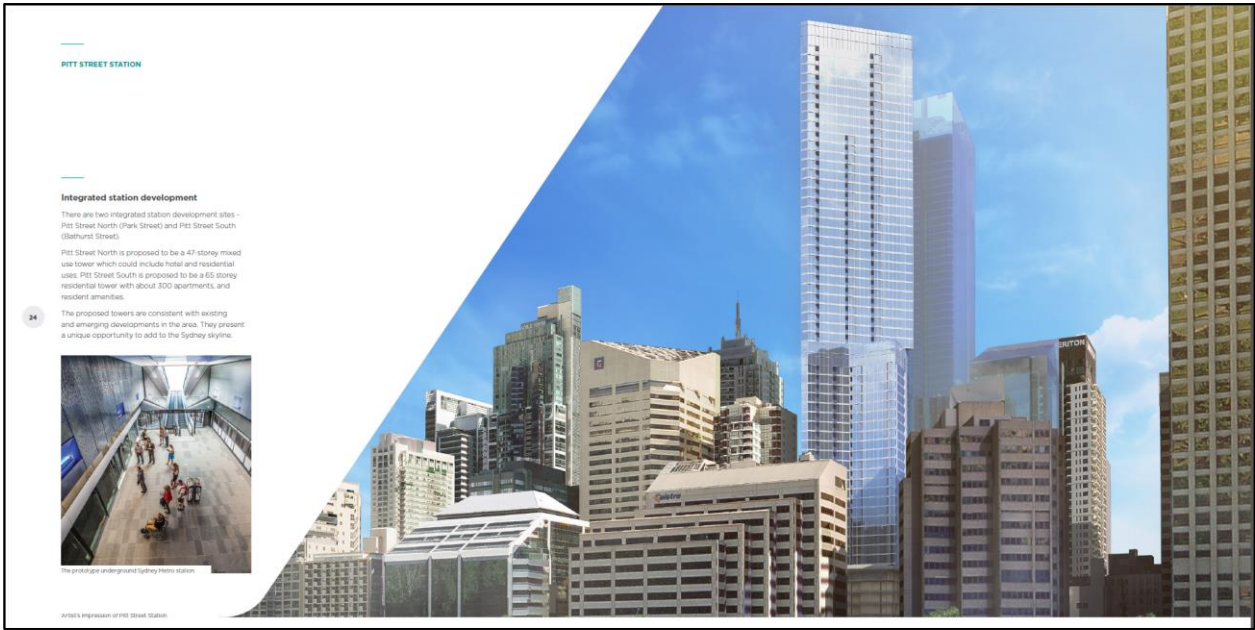
Figure 2.6 Pitt Street integrated station development newsletter