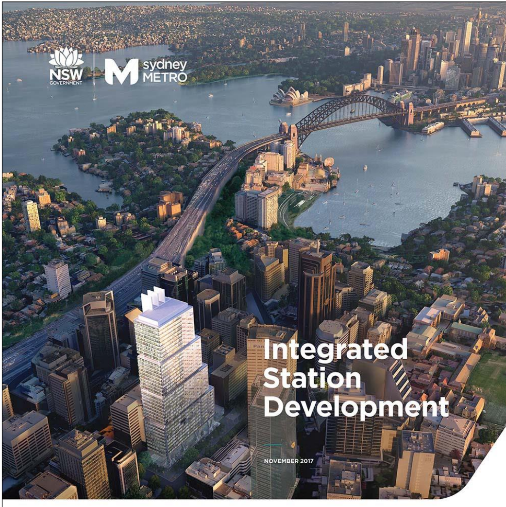
Figure 2.5 Integrated station development booklet