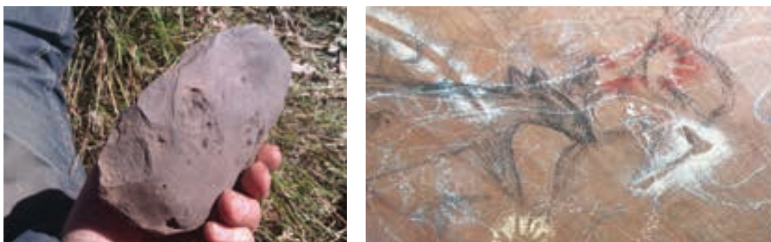
Figure 3: Ground edge axe found at a hill top site within the Sydney Metro Northwest area and an example of Sydney Region Aboriginal rock art with a mythical figure holding an axe (L-R). Sydney Metro Northwest Archaeological Salvage Program , Plate 9, page 22.