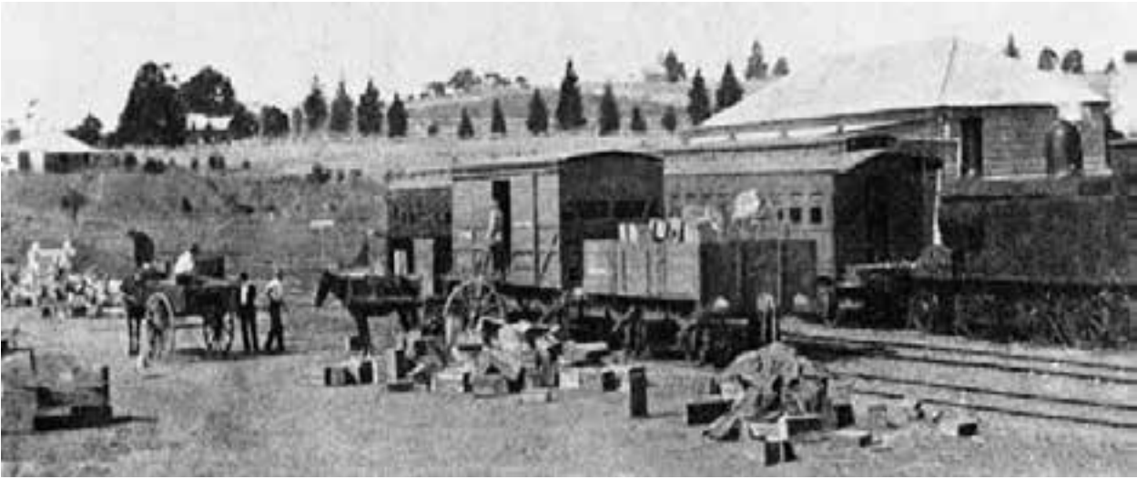
Figure 2: Loading fruit at Carlingford Railway Station for transportation to market, c. 1923. This station was initially known as Pennant Hills Railway Station. Its name was changed to Carlingford Railway Station in 1901.