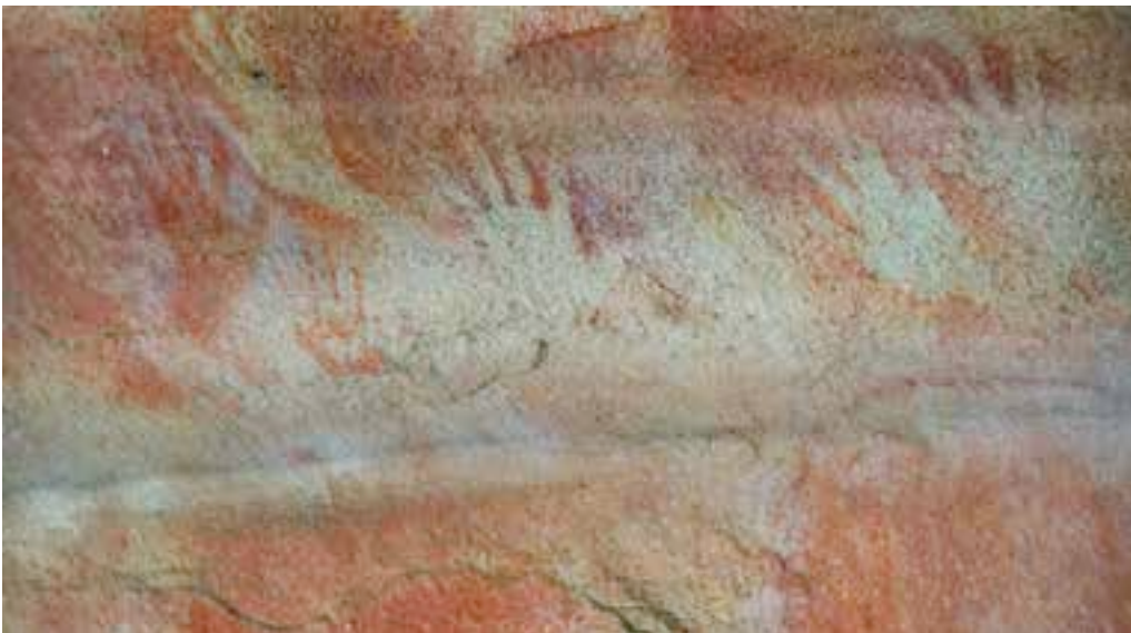
Figure 5: Aboriginal hand stencils, Red Hand Cave, Blue Mountains National Park, believed to be between 500 and 1600 years old. National Parks NSW: http://www.nationalparks.nsw.gov.au/things-to-do/Aboriginal-sites/Red-Hands-Cave

Black, white or yellow paint looks good against cream or ochre coloured paper or fabric.