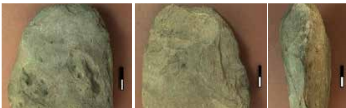
Figure 4: Three views of an axe/hatchet made of hornfels. This axe was constructed from a water-worn pebble of hornfels and probably used as both an axe and hammer. Axe grinding grooves have been identified at Caddies Creek, near where the axe was discovered. Sydney Metro Northwest Archaeological Salvage Program , Plate 47, page 16.