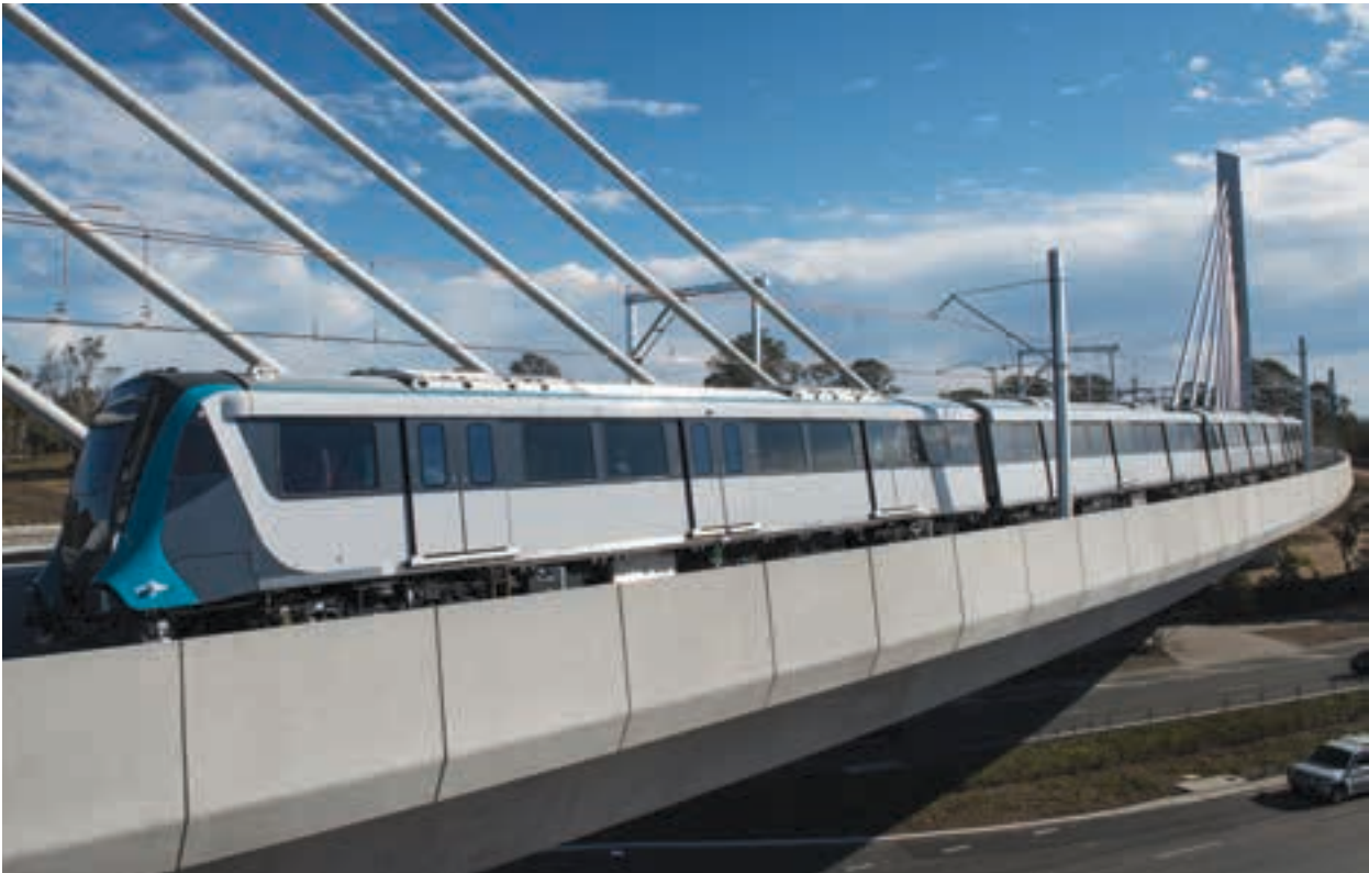
Figure 4: Sydney Metro train testing over Windsor Road bridge, July 2018.