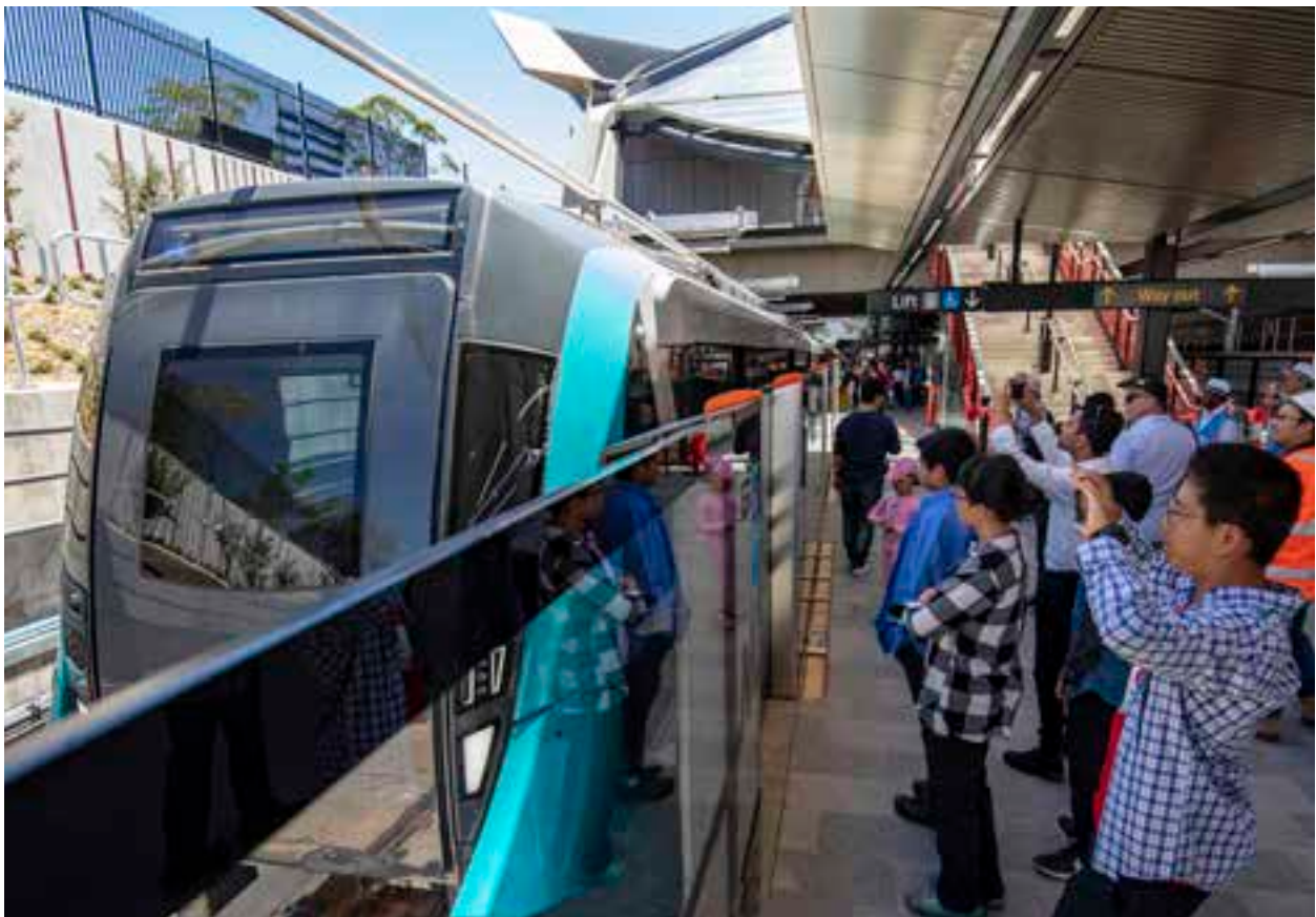
Figure 2: First look at Cherrybrook Station, February 2019.

The project includes construction of twin 15-kilometre tunnels from Bella Vista to Epping. Four mega tunnel boring machines (TBMs) built the twin tunnels on Sydney Metro Northwest. This was the first time in Australian history four TBMs were used on the one transport infrastructure project.