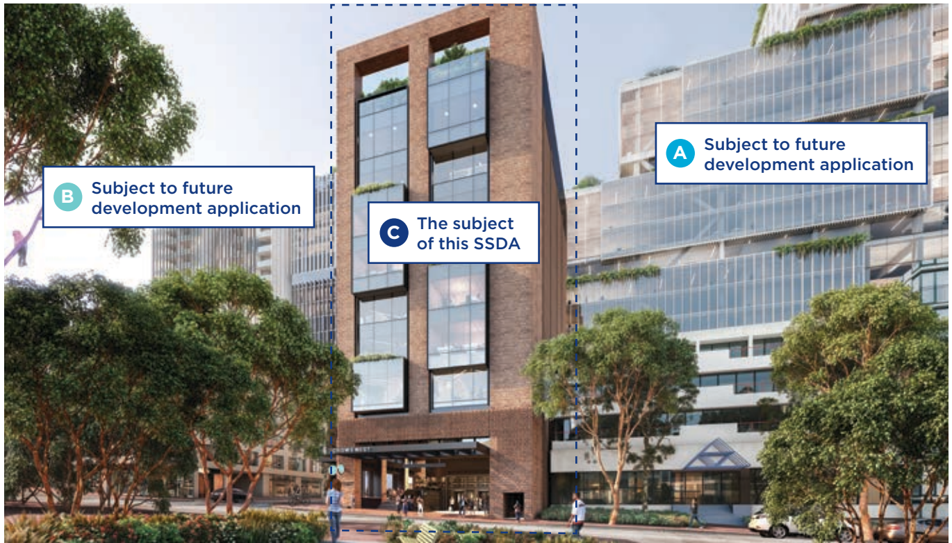
An artist's impression of the Crows Nest over station development proposal showing Site C on Clarke Street.