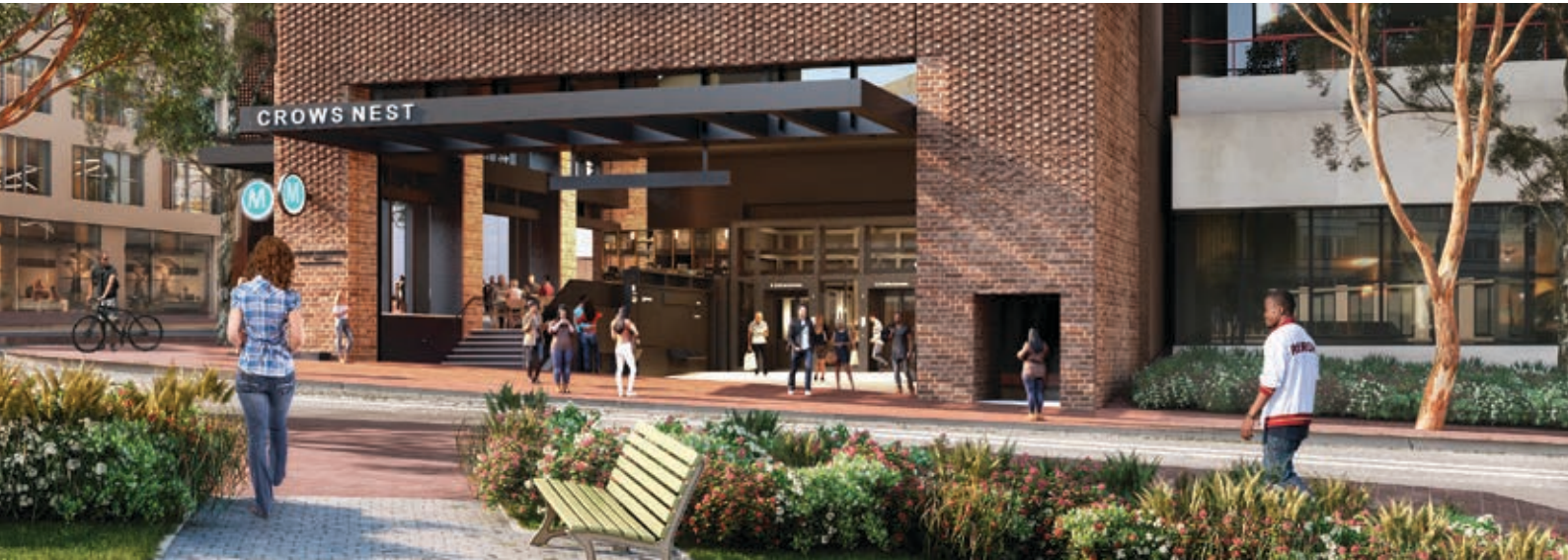
An artist's impression of Crows Nest Station entrance on Clarke Street, underneath the Site C over station development.