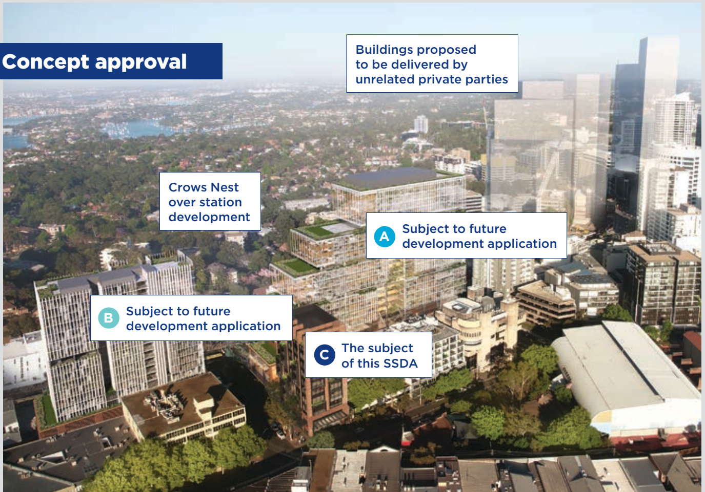
An artist's impression of the approved Crows Nest over station development proposal showing Site C. Subject to change as project progresses.