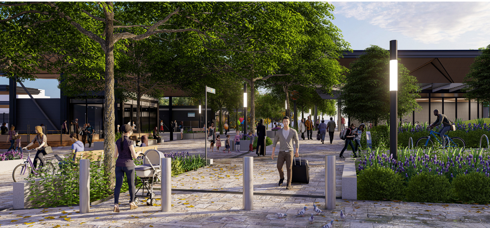
An artist's impression of the new public plaza at Bankstown Station.