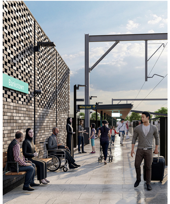
An artist's impression of the Bankstown metro station platform.