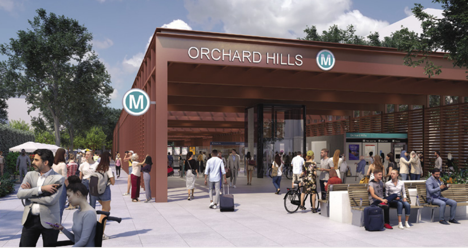
An artist's impression of Orchard Hills Metro Station.