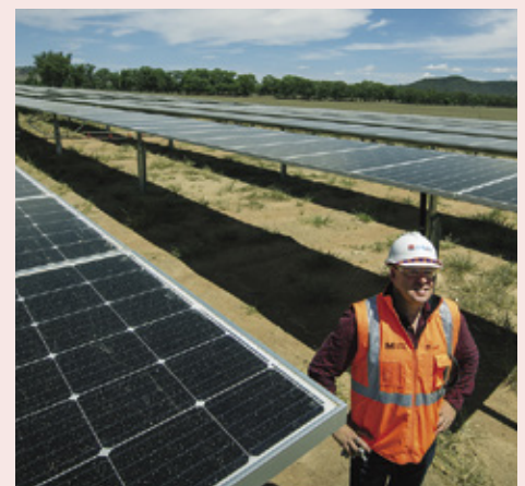
The Sydney Metro – Western Sydney Airport project will be net carbon zero.

All carbon emissions generated during construction and operation will be reduced and offset.