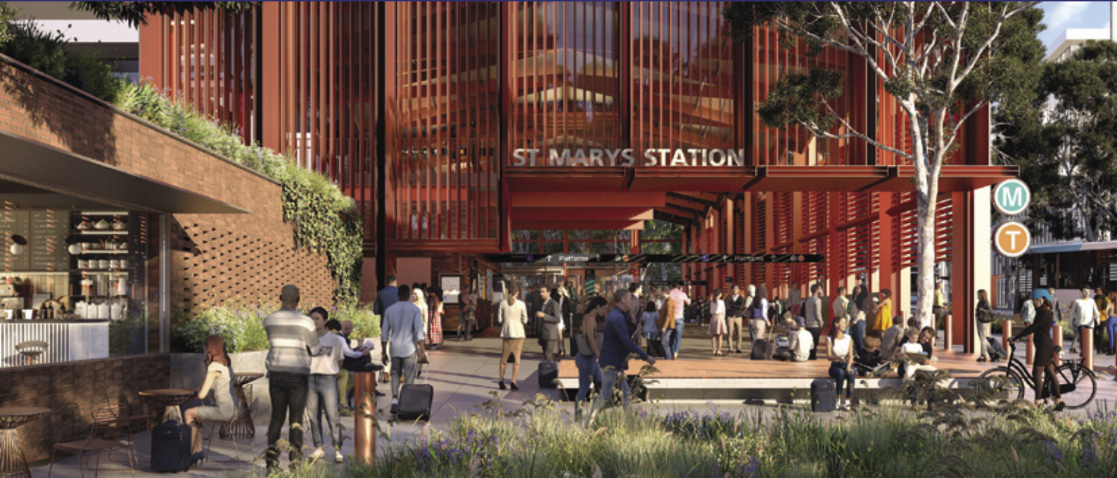
An artist's impression of St Marys metro station.