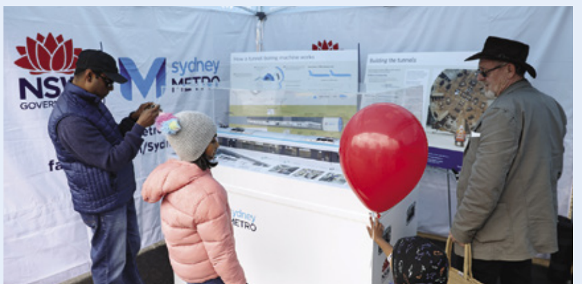
The Sydney Metro–Western Sydney Airport team at the St Marys Festival.